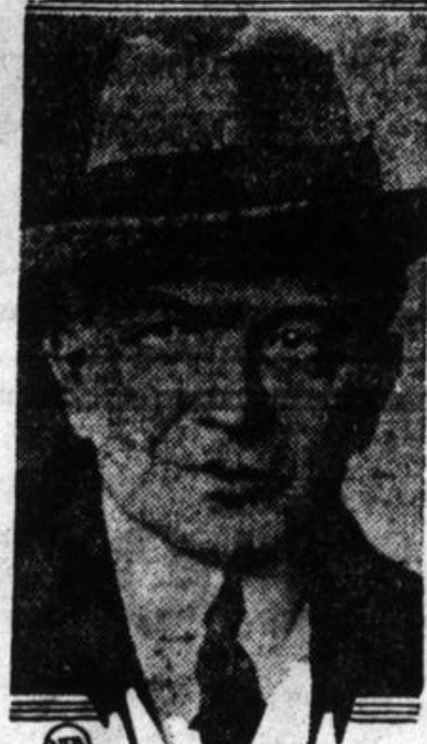
W. C. DURANT.

on Wall Street followed. Durant cleaned up $10,000,000. Again fear his rept into the marrow of Wall Street's bones. Again Wall Street is watching