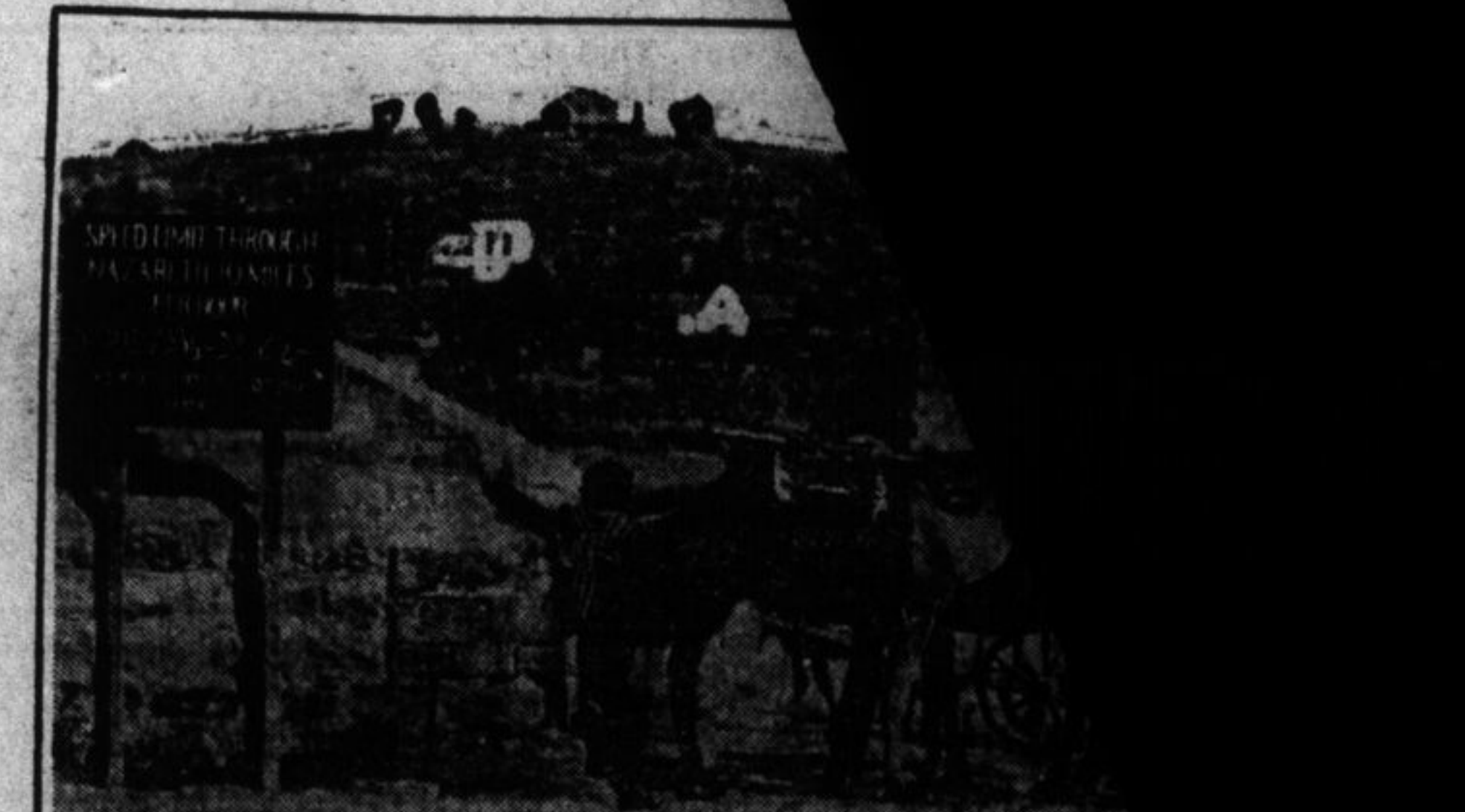
RATHER SPEEDY FOR A CAMEL AT THAT! Over in Nazareth, in the Holy Land, there's a sign that reads: "Speedy 10 Miles Per Hour."