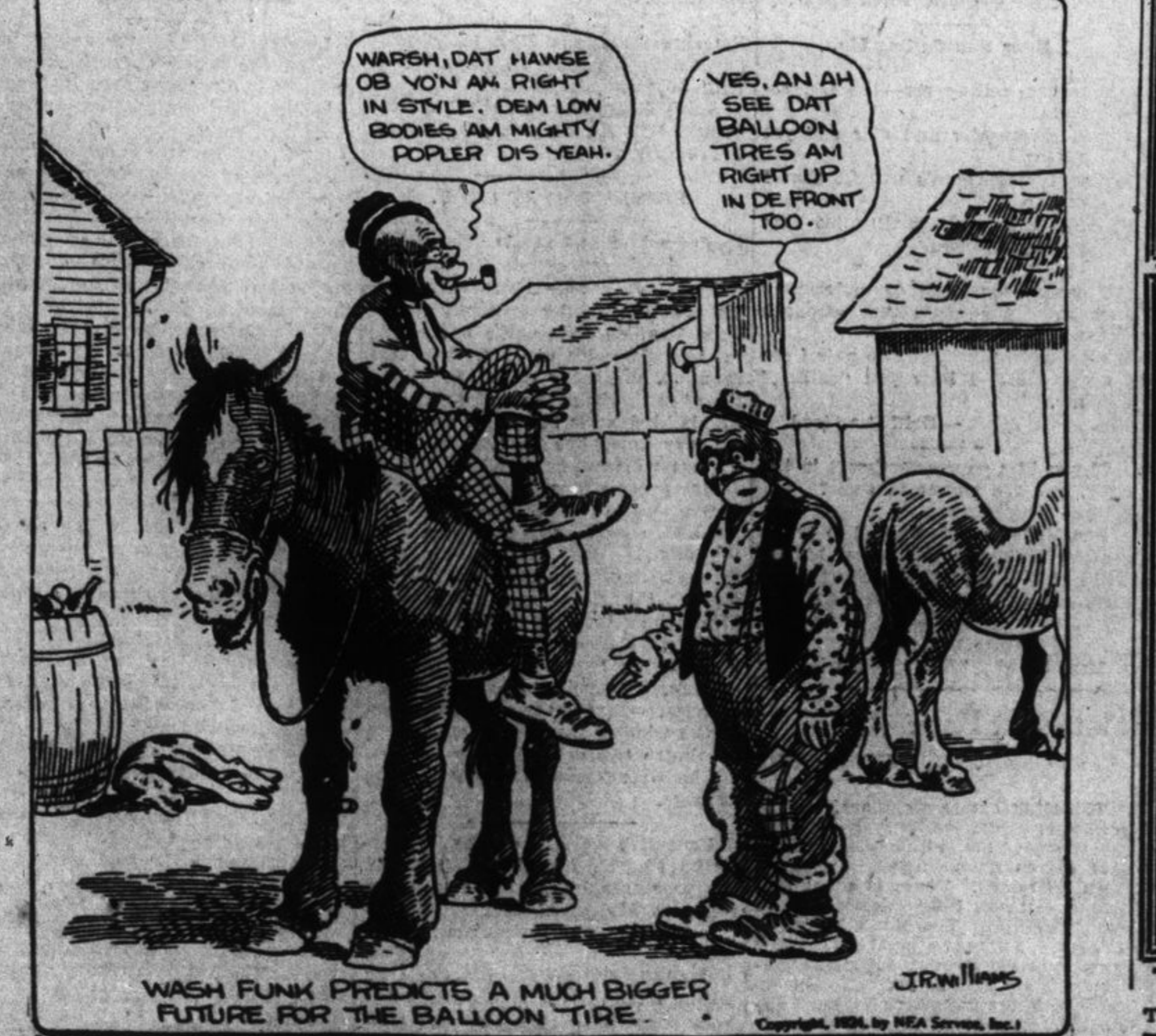
WASH FUNK PREDICTS A MUCH BIGGER FUTURE FOR THE BALLOON TIRE.