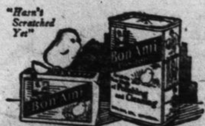
Cake or Powder whichever you prefer