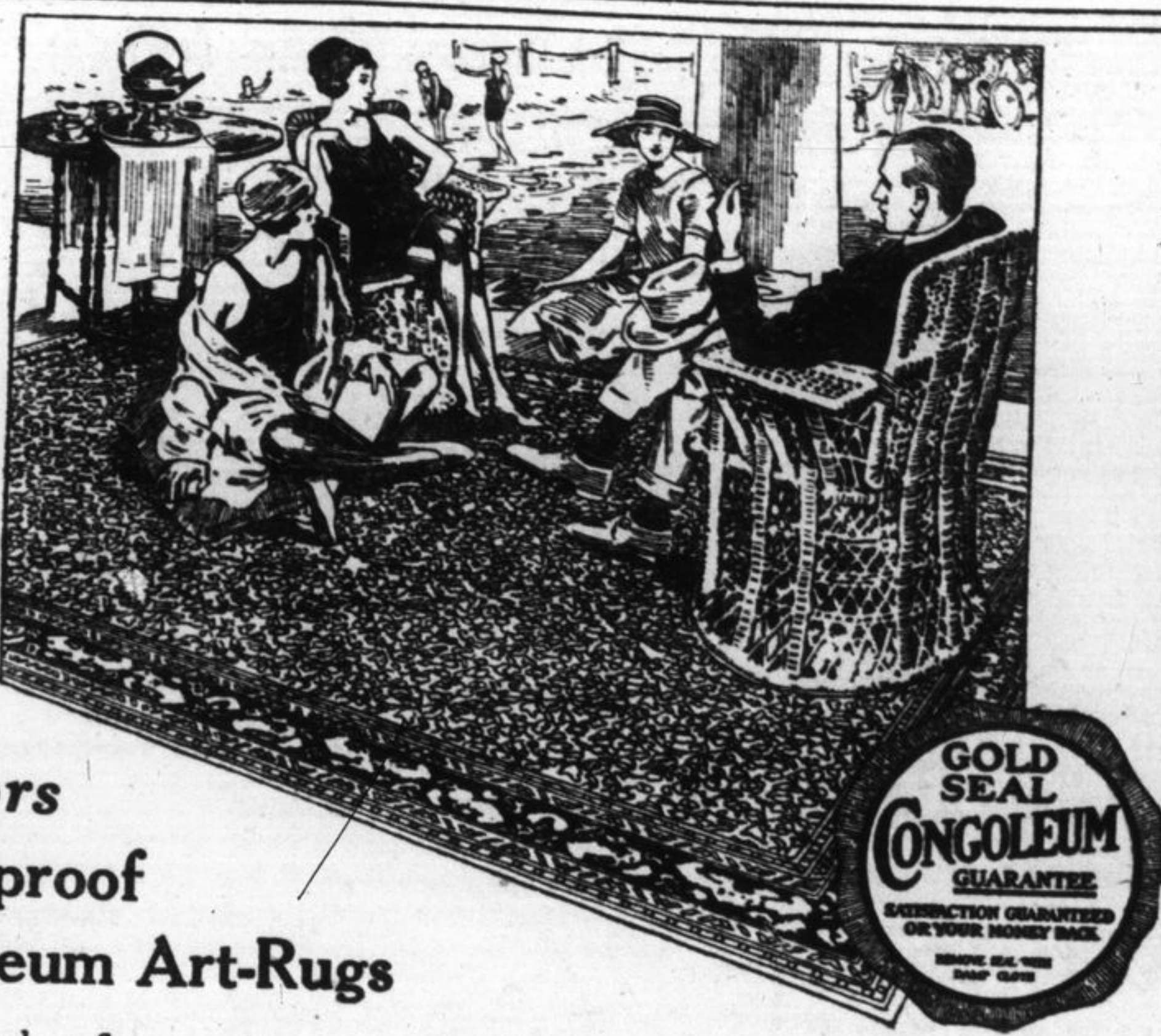
The pattern on the porch, No. 379, is a pleasing all-over floral design in gray and blue. The 9 x 6-foot size costs but $9.00. This pattern may also be secured in a delightful tan-and-blue color scheme, No. 378.