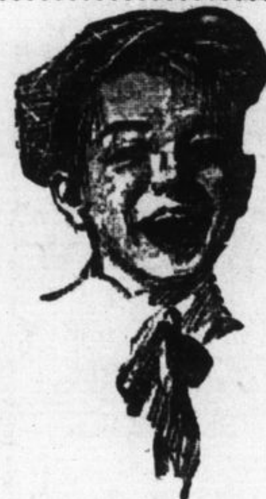
TUXIS BOYS TRAIL RANGERS

As announced in our last issue this column will carry suggestions for Tuxis Squares and Trail Ranger Camps in carrying on their summer activities.