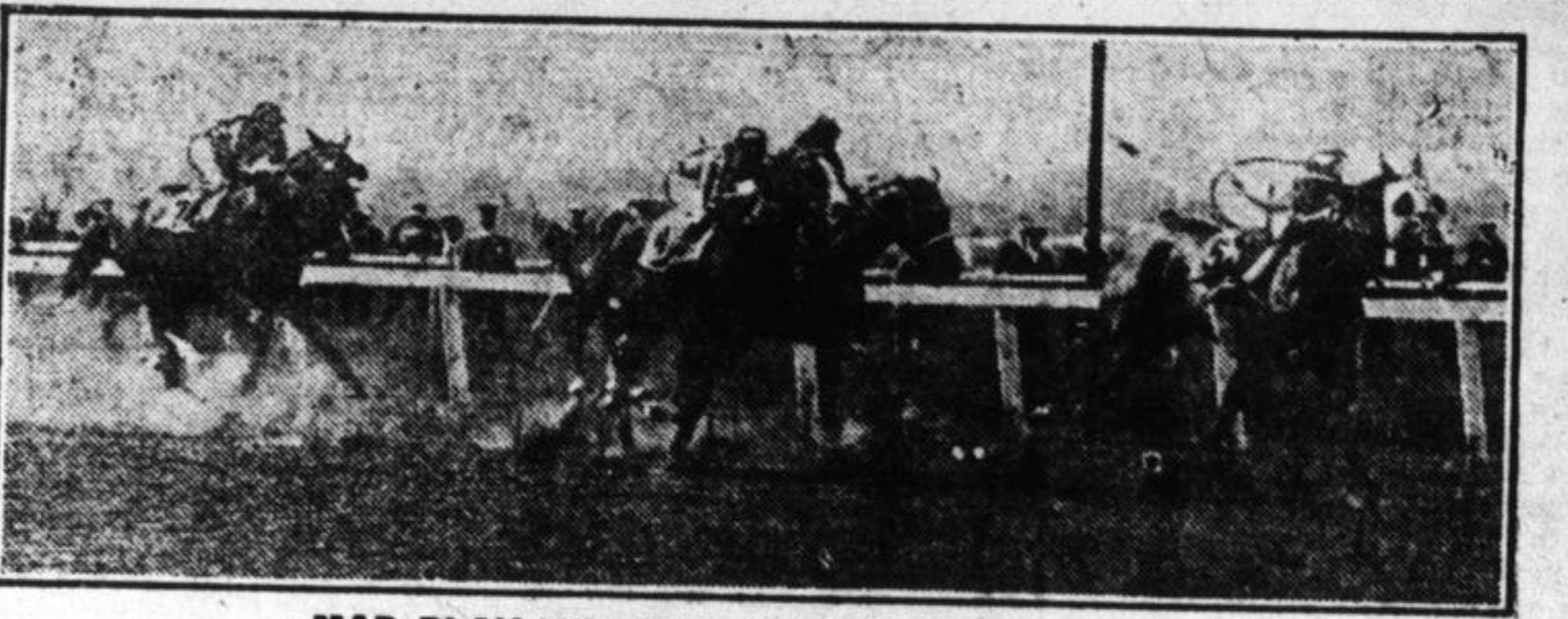
MAD PLAY WINNING $50,000 BELMONT The Belmont $50,000 turf classic of Belmont Park (Long Island) with Mr. Mutt, Bud Fisher's horse, second.

Special Offer, Saturday Only, City Dairy Creamery Butter 33c. lb. 382 PRINCESS STREET. PHONE 2673.