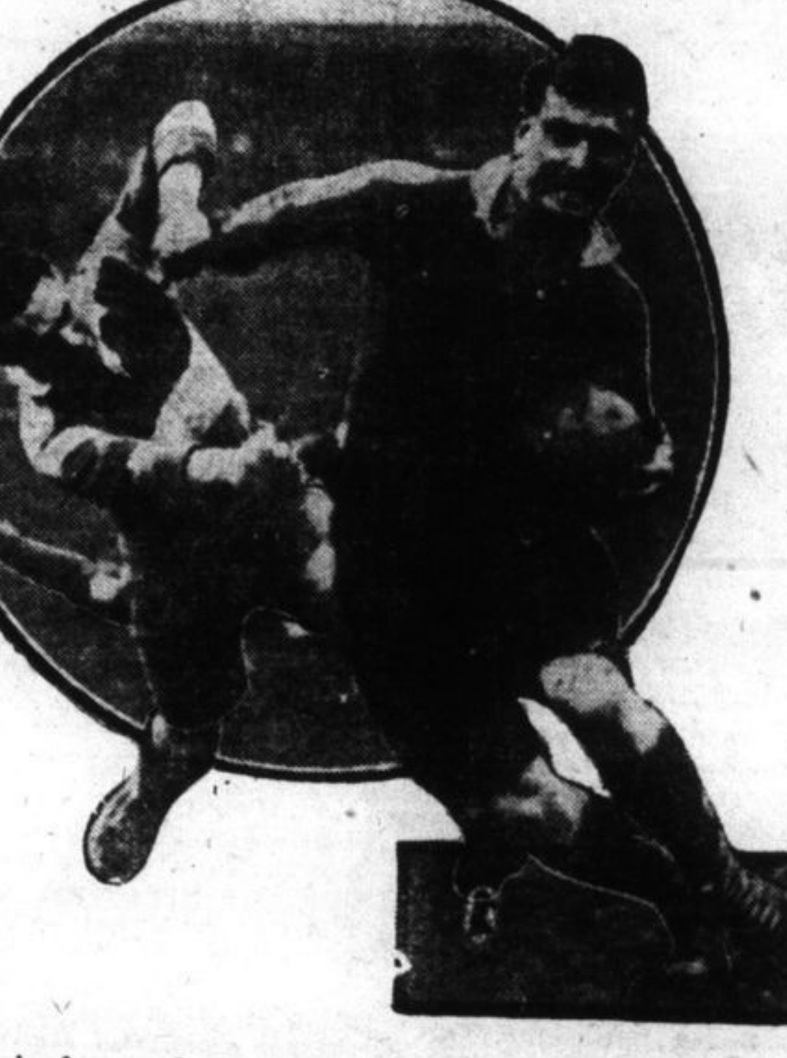
A Guy's forward handles 'em rough and scores a try. Photograph shows an incident in the match when Guy's defeated University College Hospital 53-0, at Richmond, England.