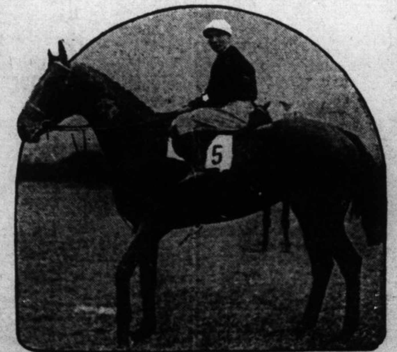
WINNER OF HISTORIC EPSOM DERBY Sansovino, owned by Lord Derby, which won the Epsom Derby, England's racing classic.

In the United States there are 300,000,000 hens producing 14,000,000,000 eggs a year.