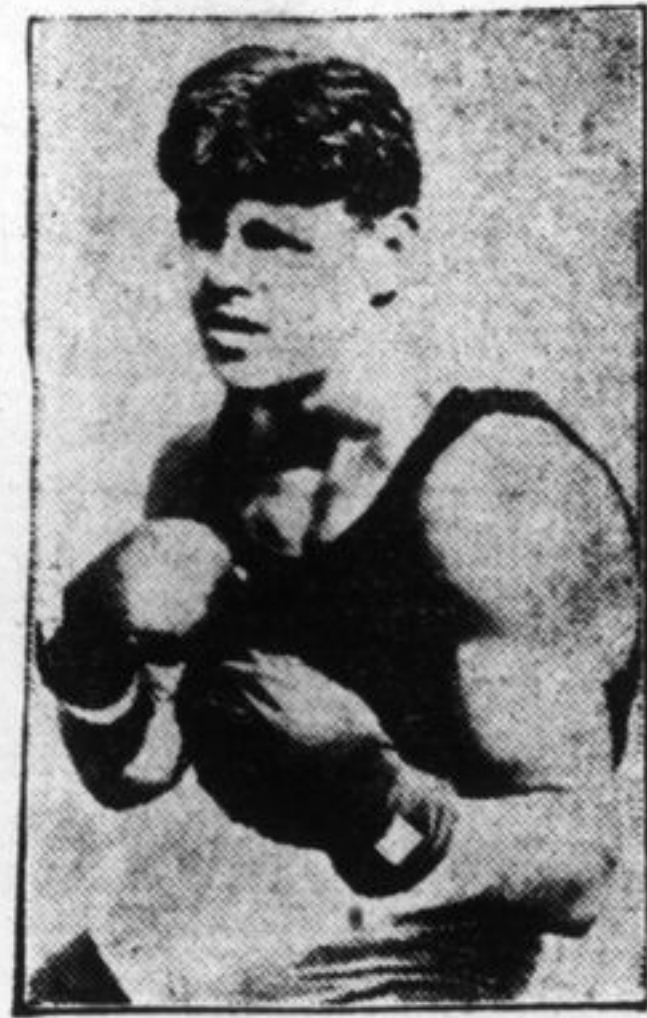
MICKEY WALKER. Welterweight champion of the world, who successfully defended his title against Lew Tendler recently in Philadelphia.

I delivered after a lot of people pronounced me through. I was able