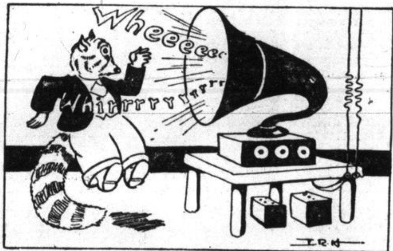
Wheeee! Whirrrr! went the big horn.

All the Green Woods people were dressed up in their Sunday best at Mister Coon's party.