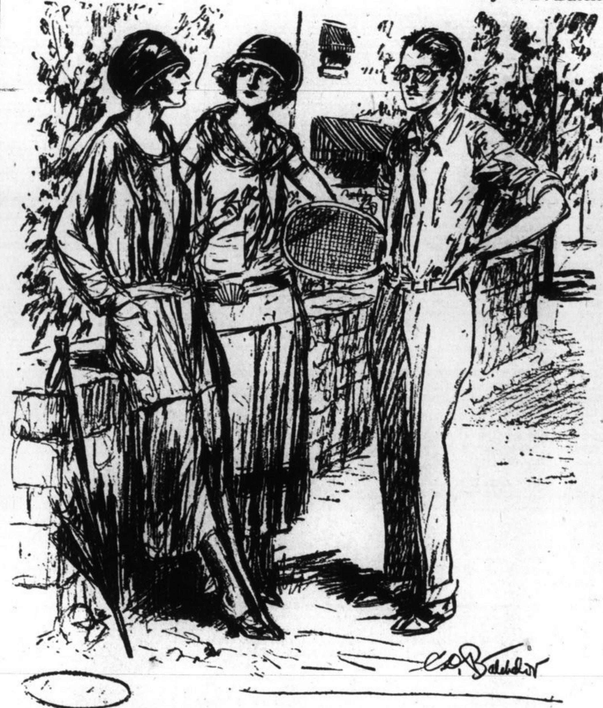
"She's going to marry John Doe if John can get a divorce from his present wife, and it seems he can, for she wants to marry Dick Roe, whom no one ever remembers except as the third husband of Nina Tread."