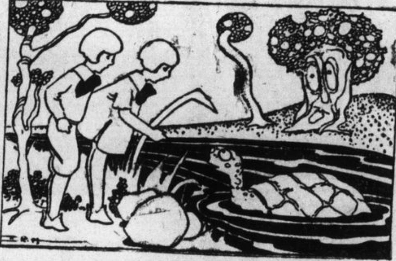
"Are you looking for somebody?"