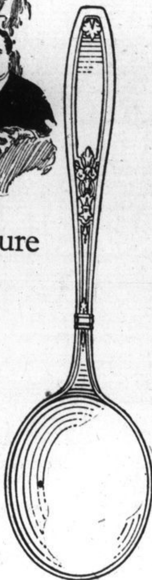
AMBASSADOR PATTERN Boatlike Spoon

May we send you a copy of our booklet, "Etiquette, Entertaining and Good Sense"? Its illustrations of table settings are authoritative to the last degree. You will find it full of suggestions for successful entertaining. Write for it to-day. Meriden Britannia Co., Limited, Hamilton, Ontario.