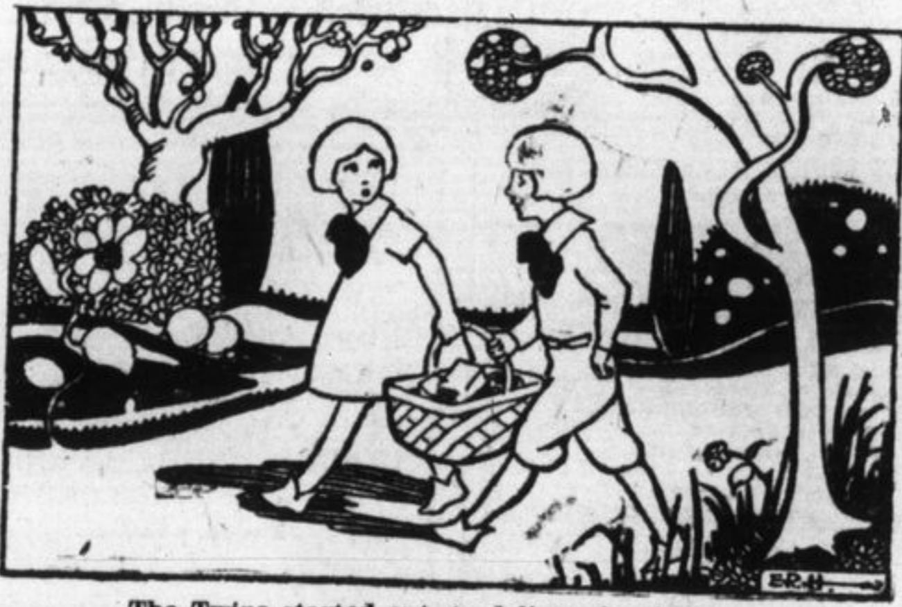
The Twins started out to deliver the things.

One day Mrs. Cracknuts telephoned to the store for some groceries. "I want two cents worth of soap," she said, "and one cent worth of tea, and five cents worth of butter, and a loaf of bread, and a pint of maple syrup."