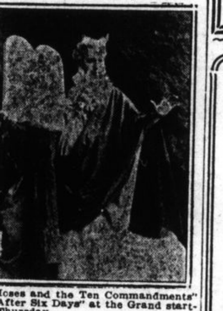
"Moses and the Ten Commandments" in "After Six Days" at the Grand starting Thursday.

During the 21 years ending in 1905, Japan had an average of 1461 earthquakes a year, most of them slight.