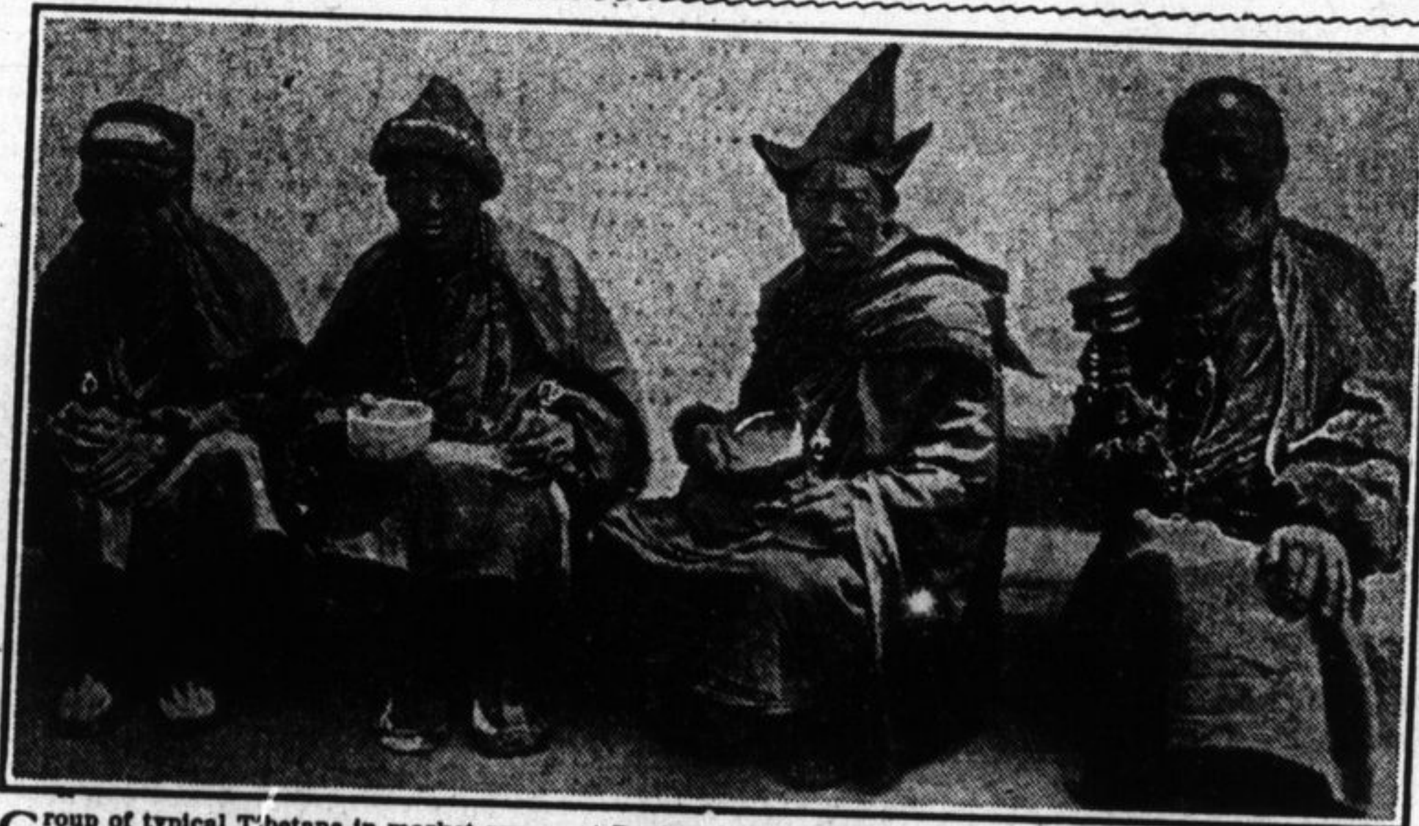
Group of typical Tibetans in market square at Darjeeling, India. The Lama priest on the extreme right is holding a prayer wheel peculiar to this region. Taken by the official photographer of Empress of Canada World cruise which will terminate when the Canadian Pacific vessel arrives at Vancouver, May 24th.