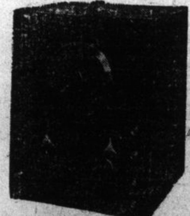
Marconiphone No. II. Sold By Us, Fully or Partially Equipped. PRICE COMPLETE $65.00 Catalogue on Request.

With loop, valves, Splitdorf headset, 6 volt 80 amp.-hour storage battery and four 22 1-2 volt "B" batteries ..... $360.00