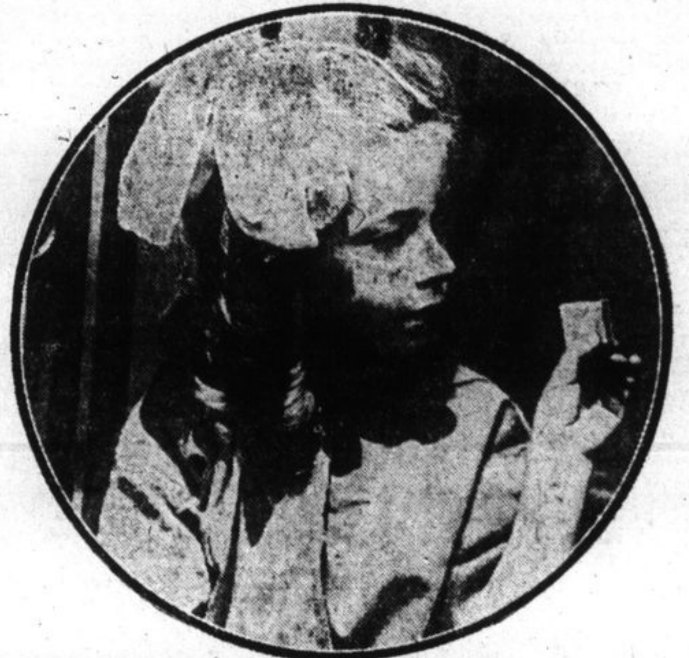
Only an eighth of an inch in length, this "smallest dictionary in the world" contains 14,000 words