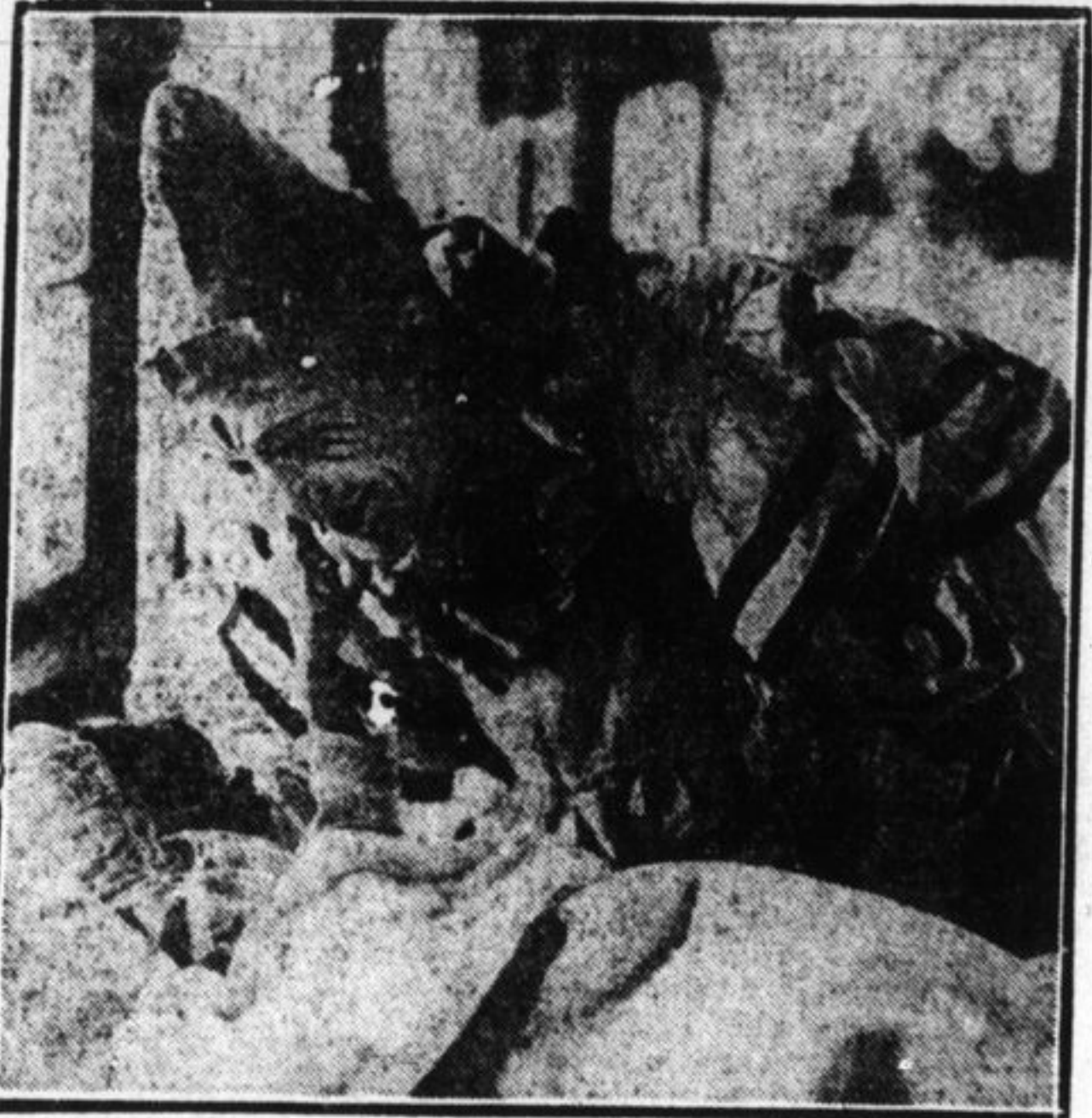
Laughter is supposed to be as good as a tonic—that's one of the reasons the clowns from a touring circus paid a recent visit to the Long Island College Hospital in Brooklyn, N.Y. The gales of merriment that came from the little shut-ins was all the reward they wanted

HEMORRHOIDS Do not suffer another day with itching, bleeding, or protruding Piles or Hemorrhoids. No surgical operation required. Dr. Chase's Ointment will relieve you at once and afford lasting benefit. Six a box; all dealers, or Edmanston, Bates & Co., Limited, Toronto. Sample box free.