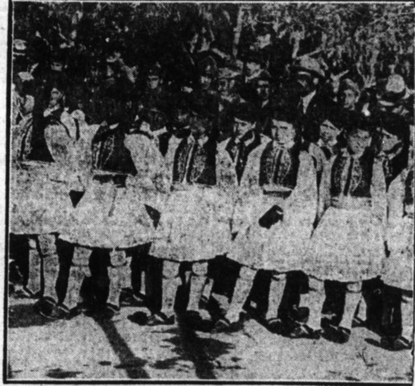
Orphan children, clad in the native costume of Greece, took a prominent part in the recent Lord Byron centenary celebrations at Athens