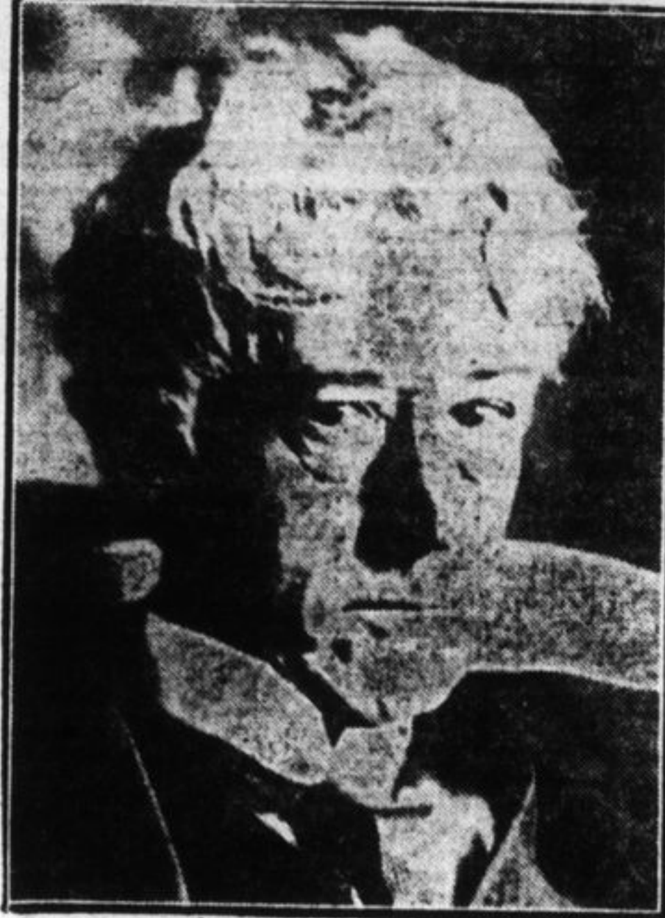
This tangled mop of hair could hardly be taken for anybody's but Judge Landis', that Napoleon of baseballdom, who, on a recent visit to Toronto and Hamilton, declared that baseball players are the most human people in the world