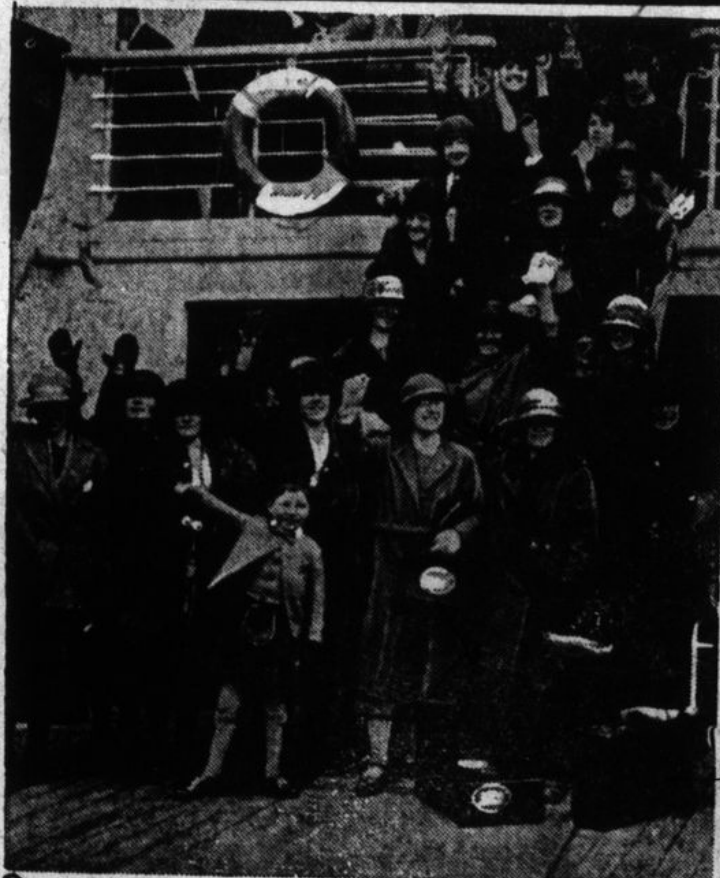
To fill Canada's need for domestic workers, these English ladies crossed the Atlantic on the "Metagama."