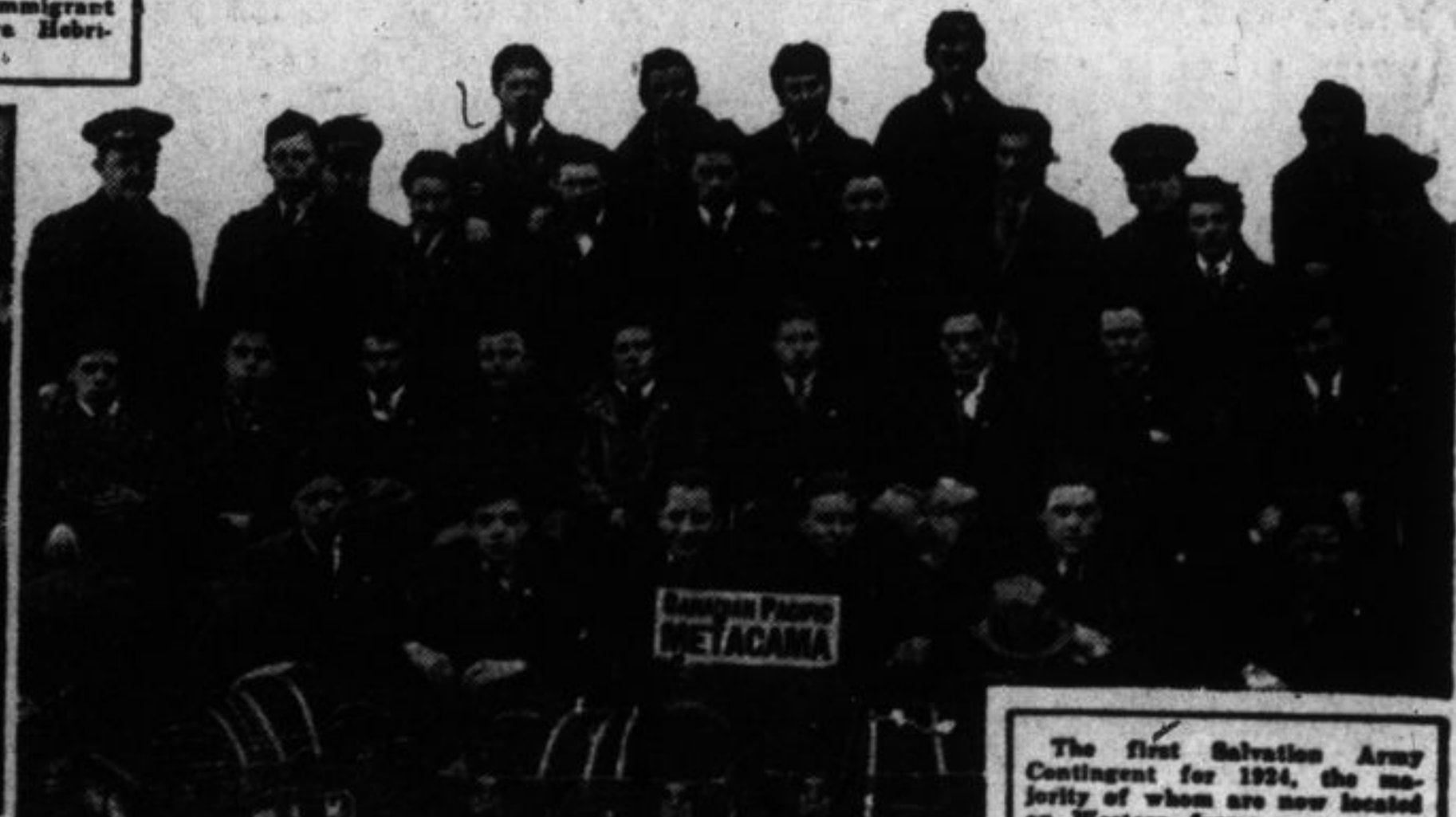
The first Salvation Army Contingent for 1924, the majority of whom are now located on Western farms.