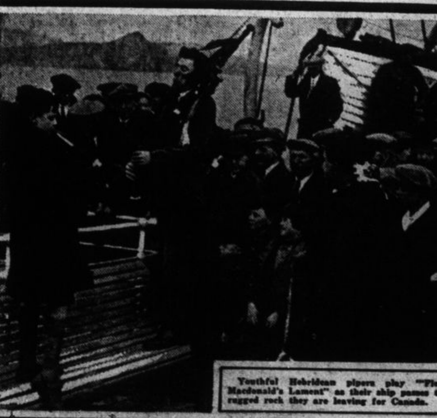
Youthful Hebrews play "Flora Macdonald's Lament" as their ship passes the rugged rock they are leaving for Canada.