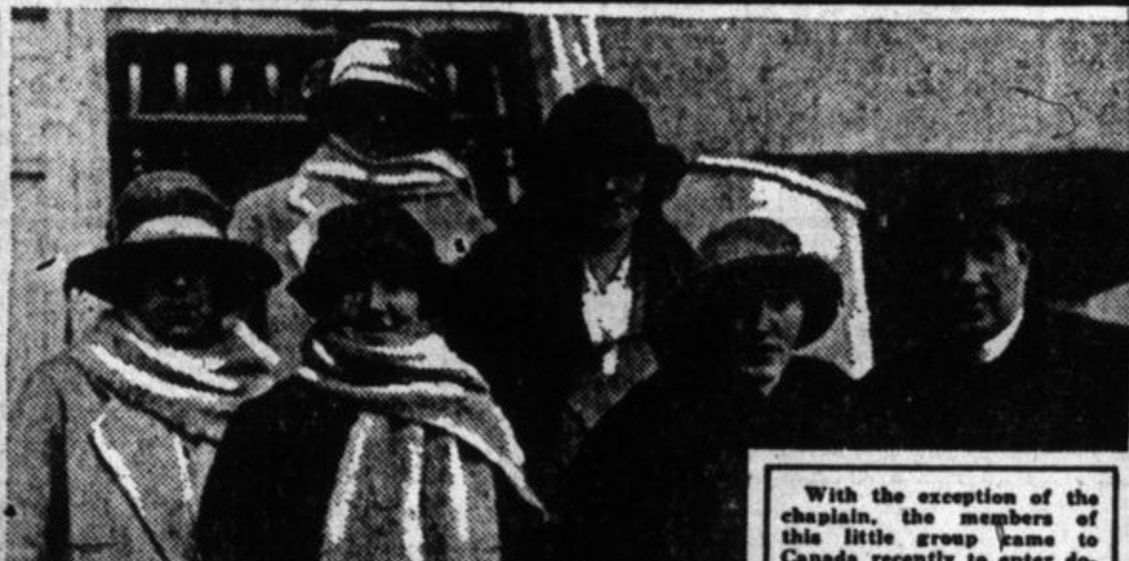
With the exception of the chaplain, the members of this little group came to Canada recently to enter domestic service. Don't rush! They're all engaged.