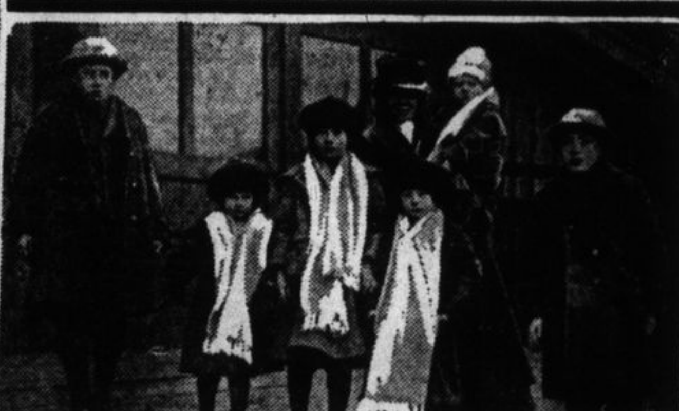
This mother wanted her sons and daughters to grow up in a land of opportunity. She migrated to Canada therefore, from the Western Isles.