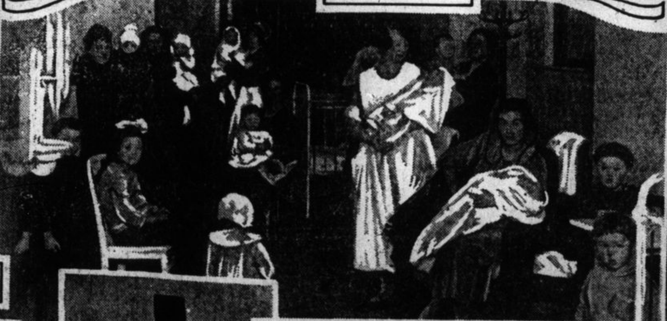
You may count thirteen youngsters here. The fourteenth juvenile immigrant, however, is seated behind the matron whose excellent work has made the nursery at the Canadian Pacific, Windsor Station, Montreal, a great boon to travelling mothers.