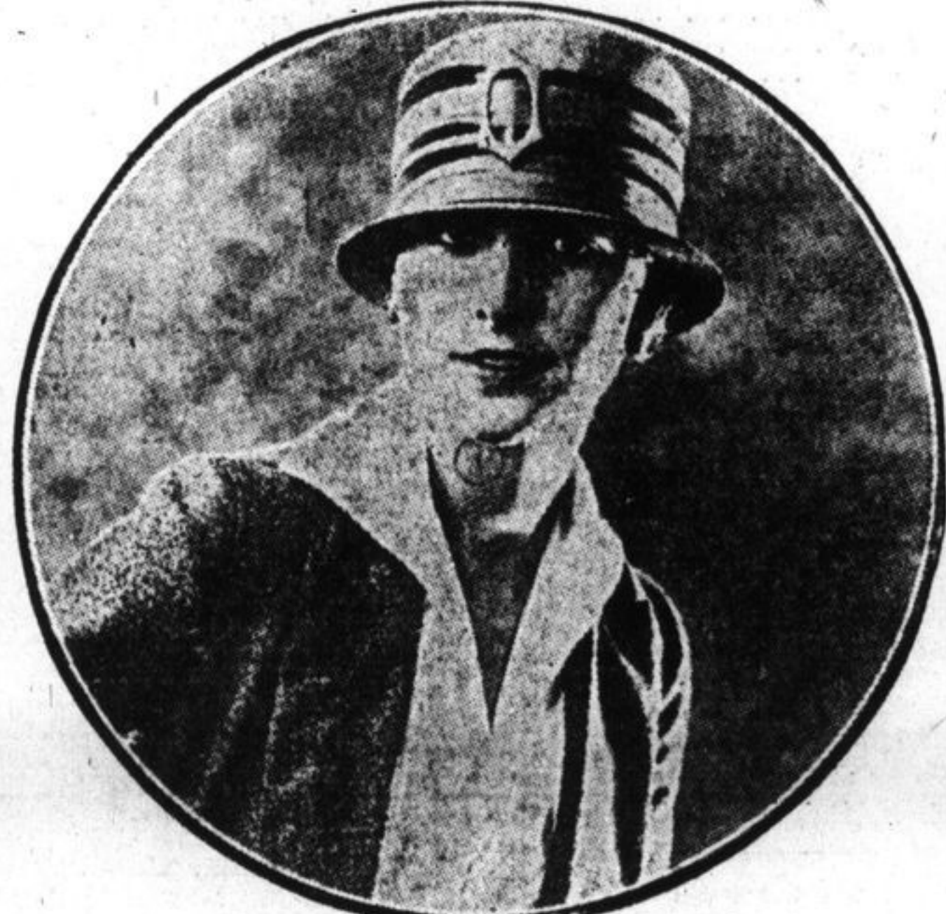
Tucked white crepe de chine with a convertible collar for either up or down wear, with groups of silk buttons, adds an air of nattiness to the season's new tailored suits