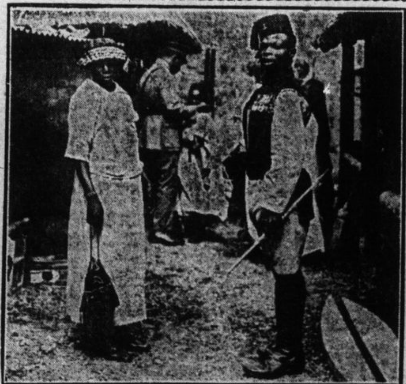
You don't have to go east of the Suez to see such scenes as this. The camera that took this was not snapped any farther east than London. These natives of Nigeria comprise part of the British Empire Exposition