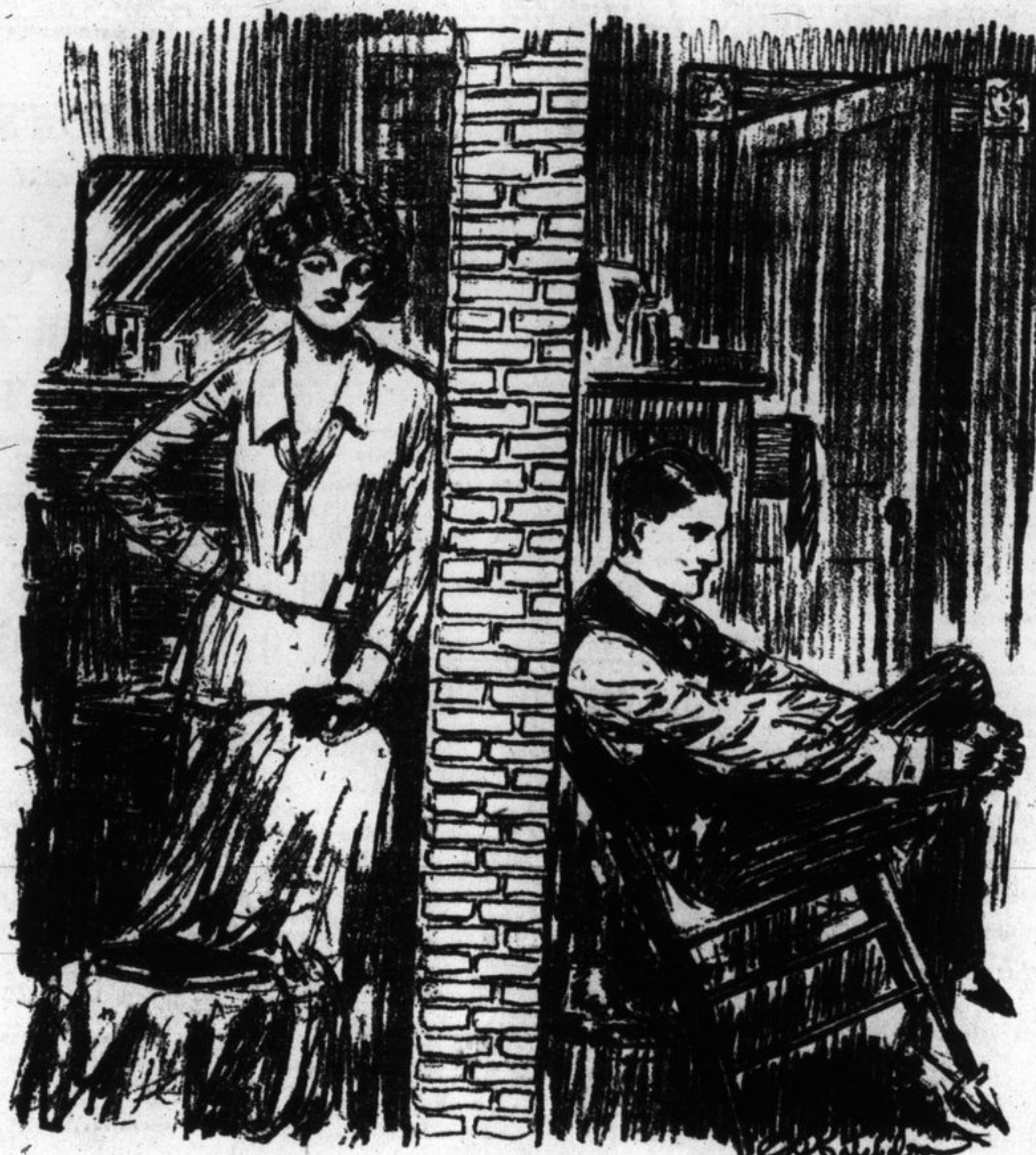
THE GUY With—'Somewhere in this town there's probably some one as lonely as I am tonight.'