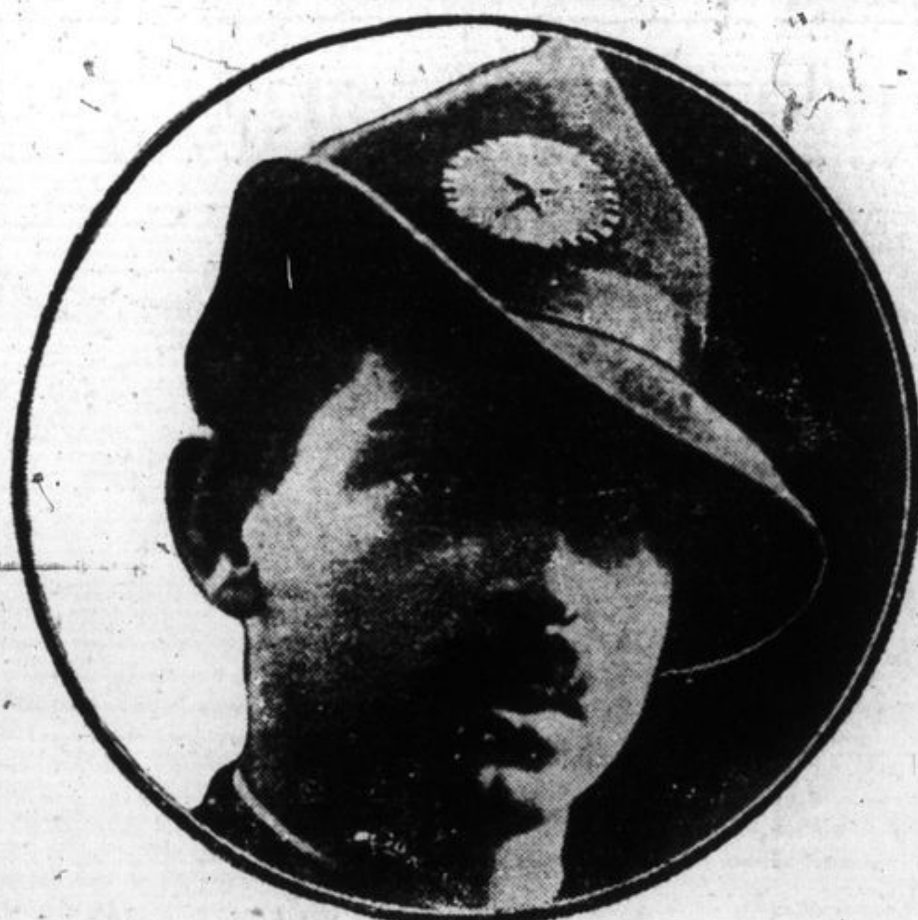
Prince Nicholas of Rumania (above), is very much in love with Princess Mafalda of Italy, whom he is unable to marry, because King Victor Emmanuel, her father, desires her to marry the crown prince of Belgium

SMITH BROS JEWELERS LIMITED ESTD 1847 King St. Kingston