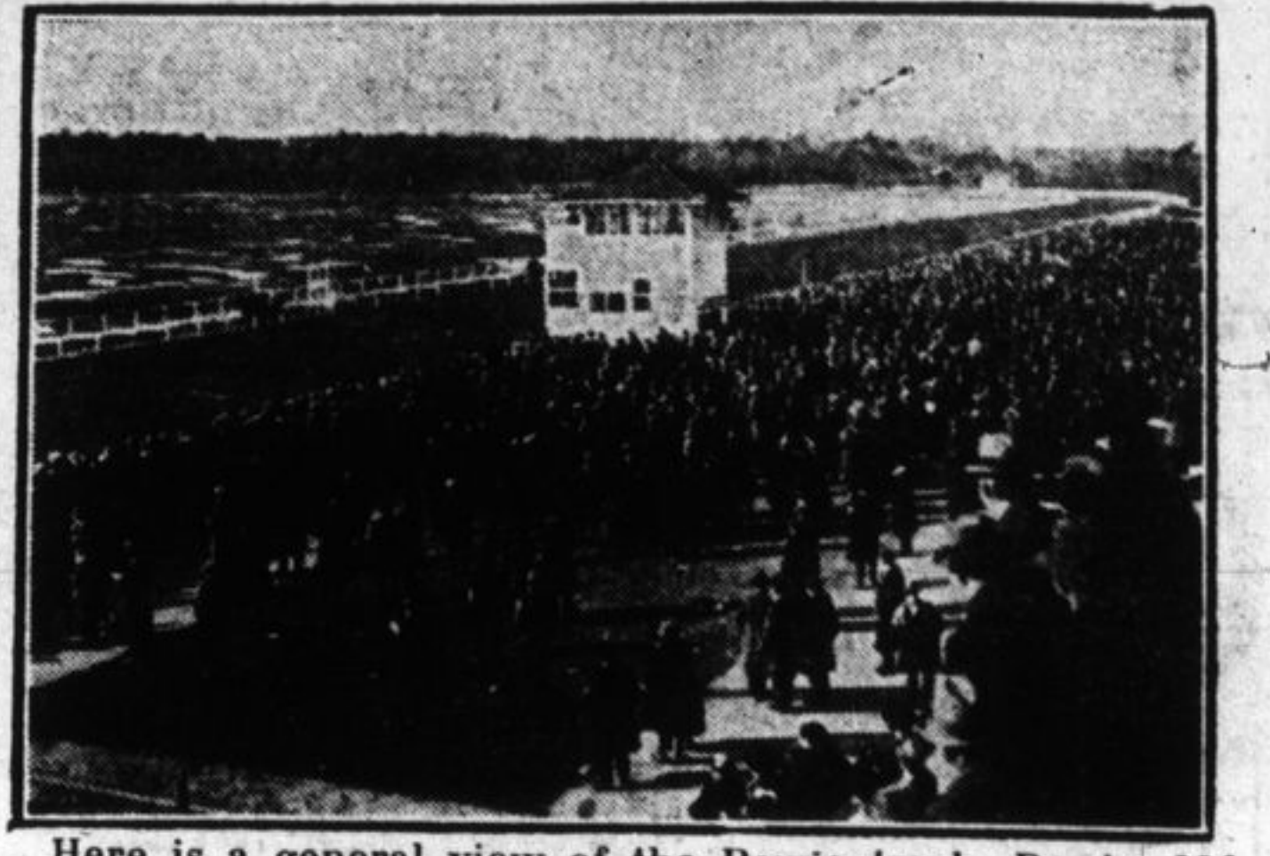
Here is a general view of the Bowie track, Bowie, Md., which opened to a record crowd recently, despite a two-day delay. It was the official opening of the course.

Moderation is the stiken string running through the pearl chain of all virtues. Where the dam leaps over, the kid follows.