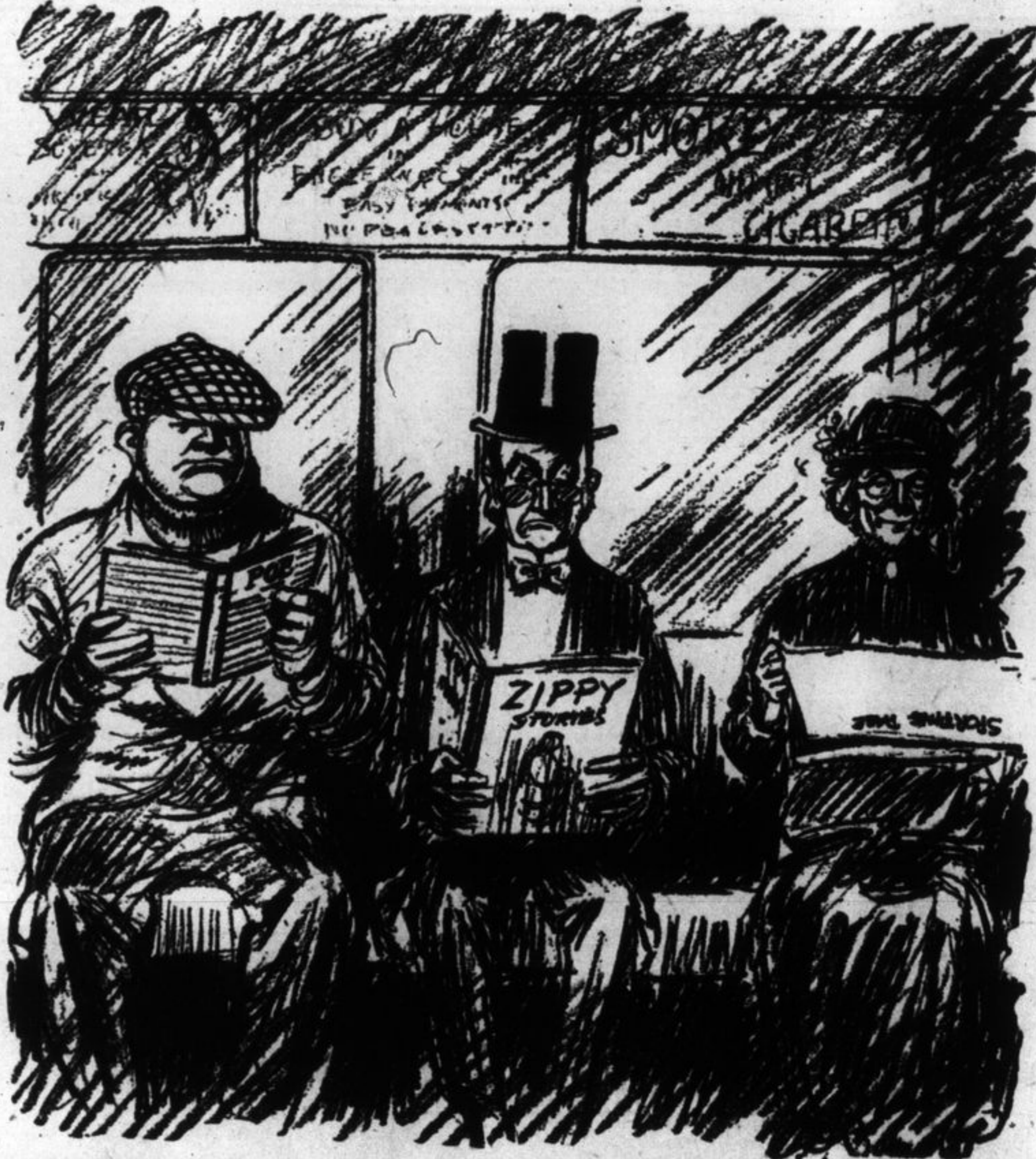
THE DECEPTION OF APPEARANCES