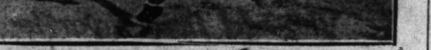
The Prince of Wales is shown, previous to his fall, going out to the starting point in the army point-to-point races near Reading. He is shown on Little Favorite, the horse that threw him

Overcoats are being shed these fine days.