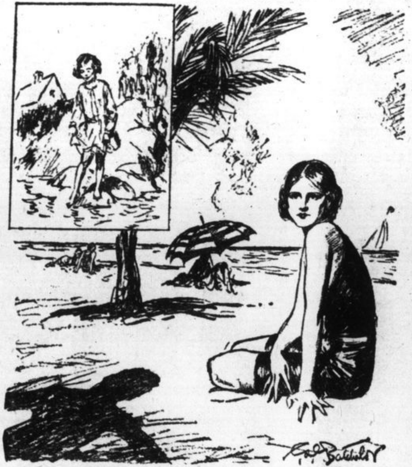
A LITTLE GIRL WHO KEPT ON PLAYING

Copyright, 1924, by Public Ledger Company