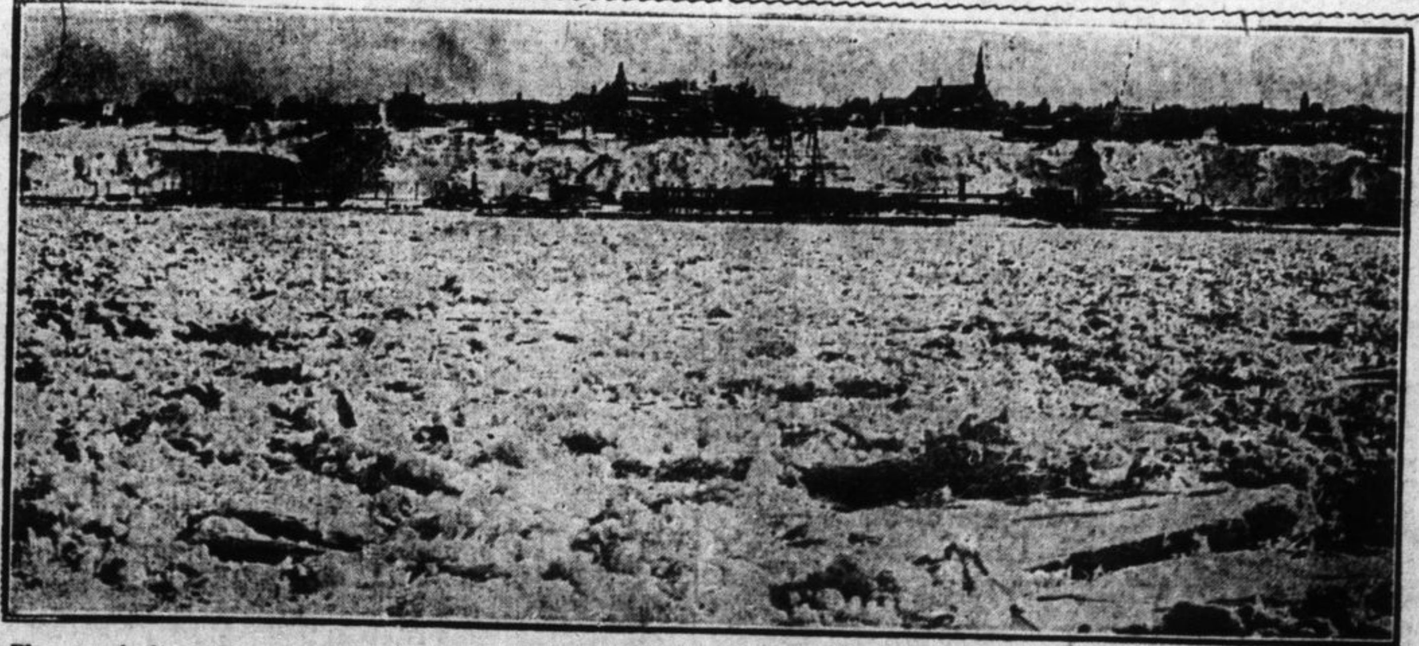
Photograph shows the ice bridge that formed on the St. Lawrence river between Quebec and Levis before it broke up recently with eight people marooned on the floes. All escaped safely after a thrilling experience