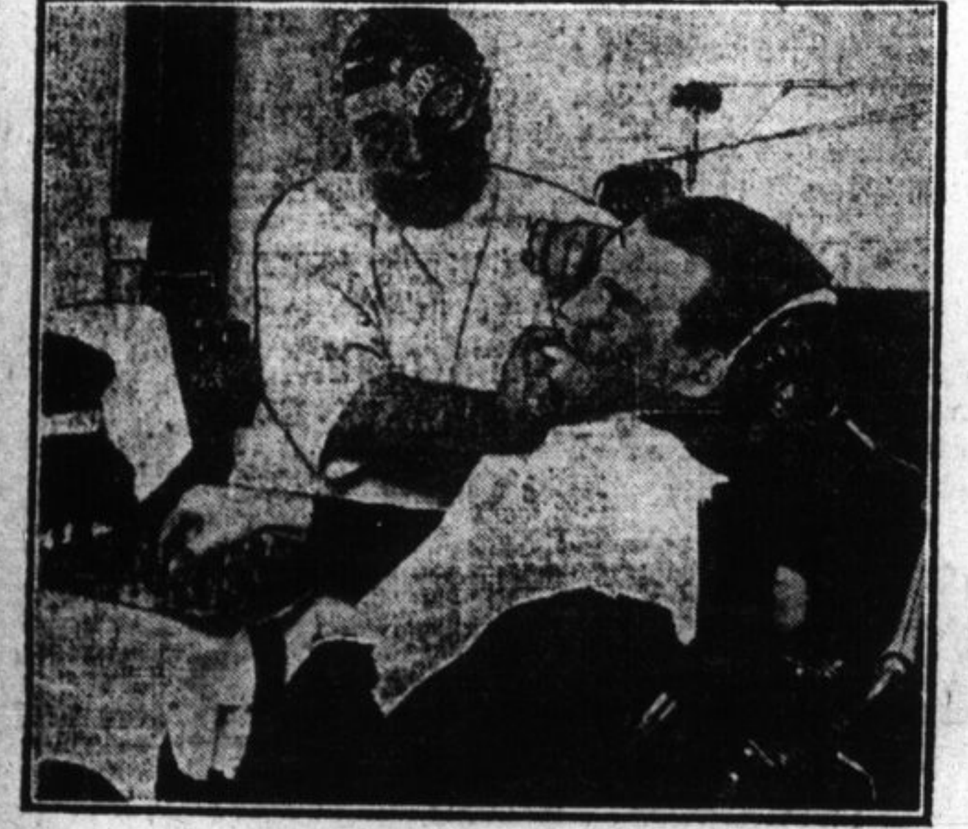
ALEXANDER ALEKHINE. Russian chess champion, recommends his favorite pastime as a dental anaesthetic when having a tooth pulled.