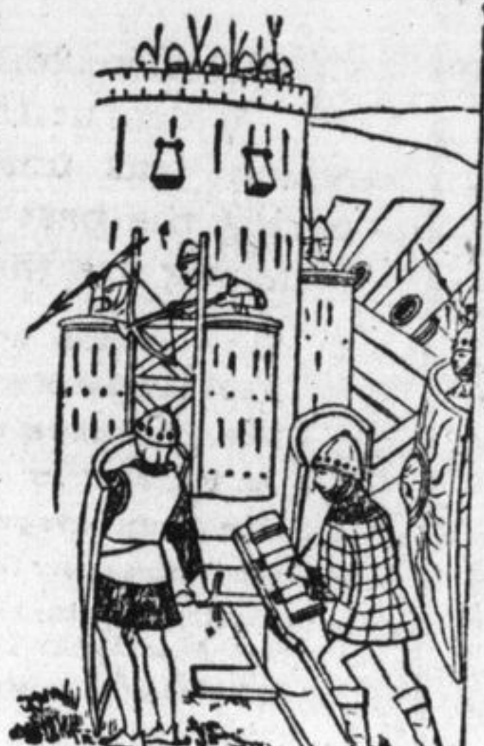
This picture was made toward the end of the Middle Ages. It shows an attack on a castle.

Sometimes when armies attacked a castle during the Middle Ages moving towers were used. These towers were placed on wheels. They were made a little higher than the walls around the castle. They were rolled toward the walls. Archers were at the top to fire at the defenders. If a tower could be pushed close