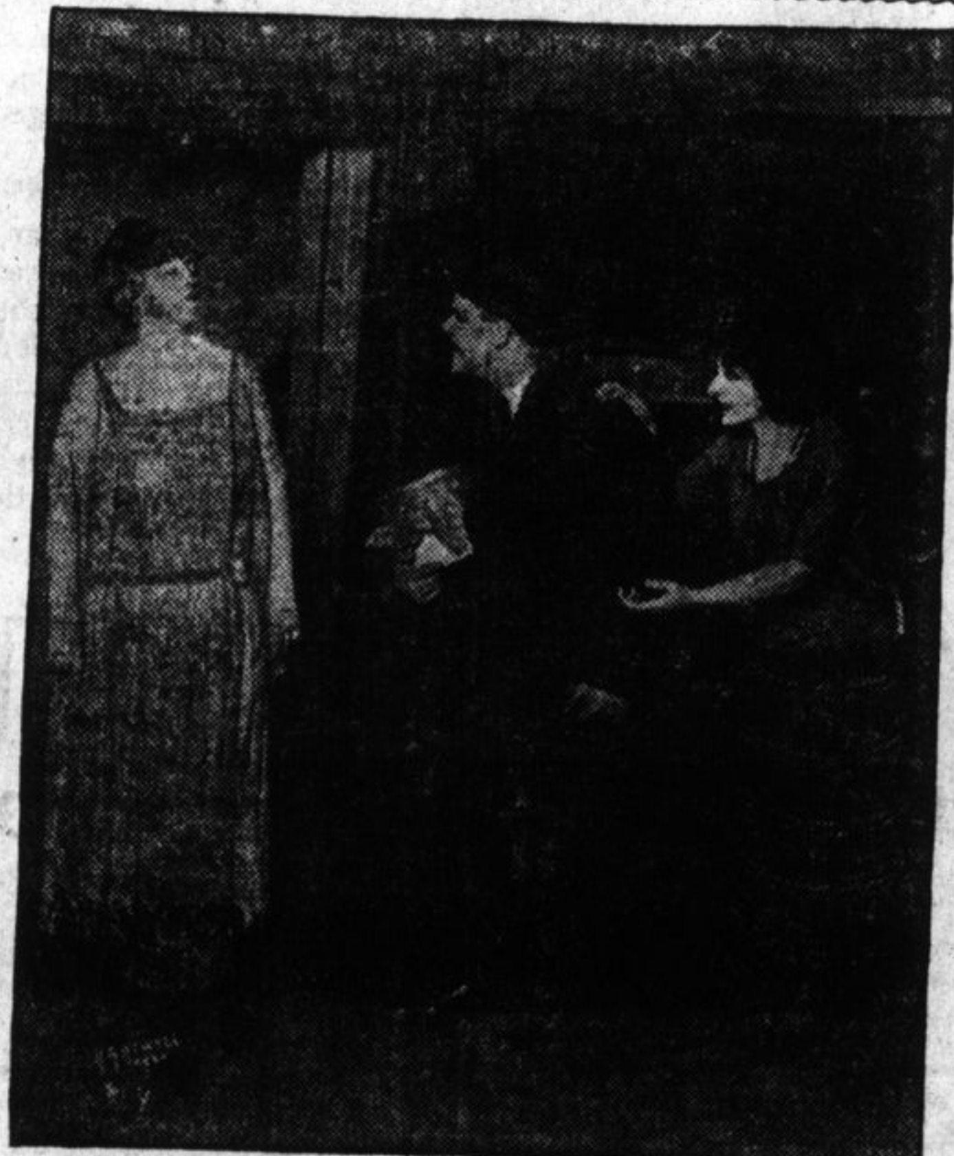
Scene from "The Unwanted Child," at the Grand Opera House to-night and to-morrow matinee and night.

One of the chief methods of introducing this interruption of the straight contour is by means of the capelet in its various ramifications and again, the division of the upper and lower sections of the coat in suit outline stimulation. The capelet is treated in a slightly flared fashion appended to the back of the form of fully flared Inverness capes, used in lieu of