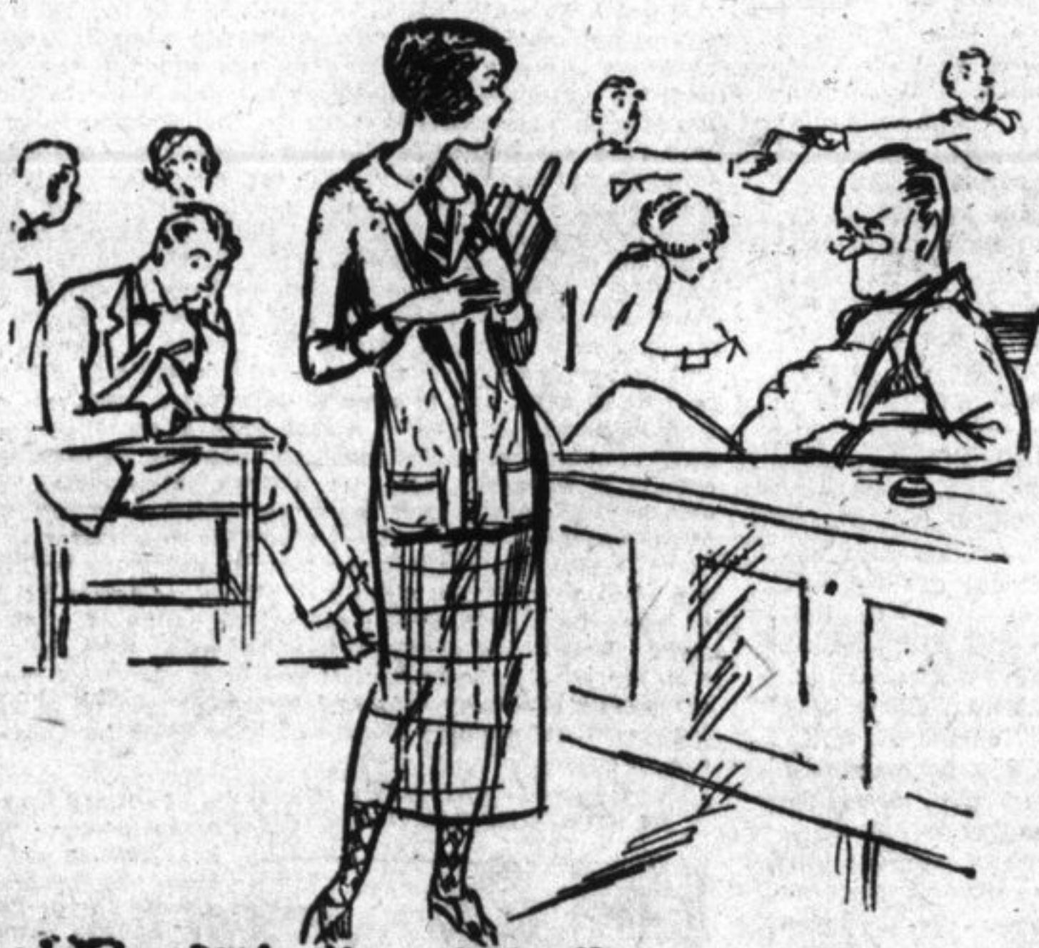
"You are a half hour late for this examination, Miss Bates."