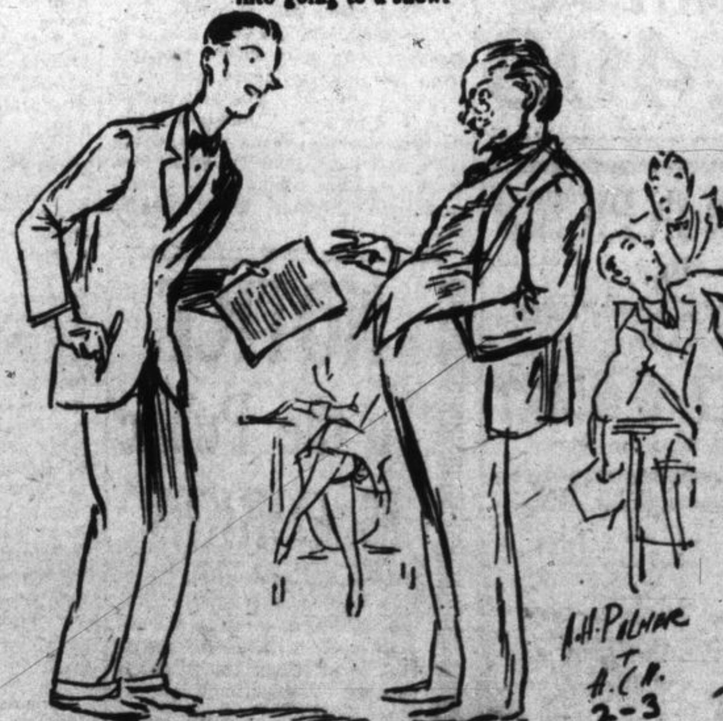
"Here's hoping I pass it, Professor Langdon. This course has sure been a nightmare for me." "Remarkable, Mr. Paige! You always appear to be sleeping quite soundly in class!"