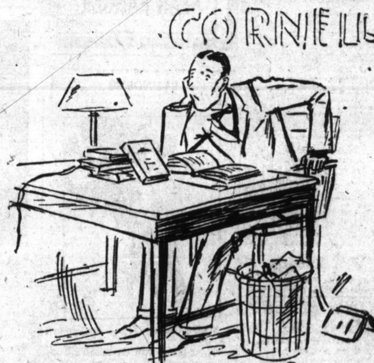
"Gee, I wish someone would come in and argue me into going to a show."