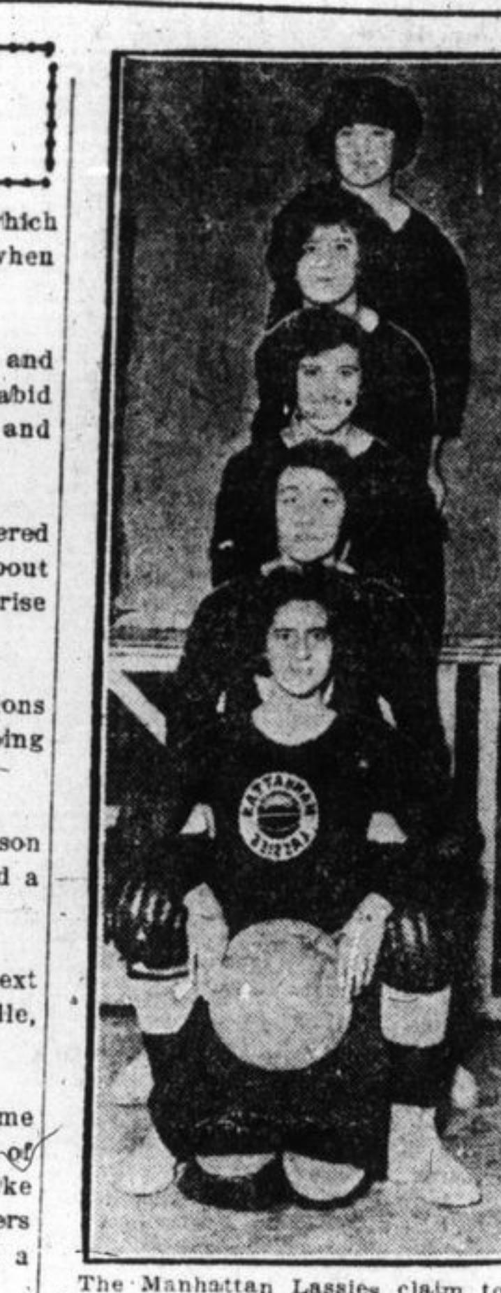
The Manhattan Lassies claim to be the girls' championship basketball team of New York.