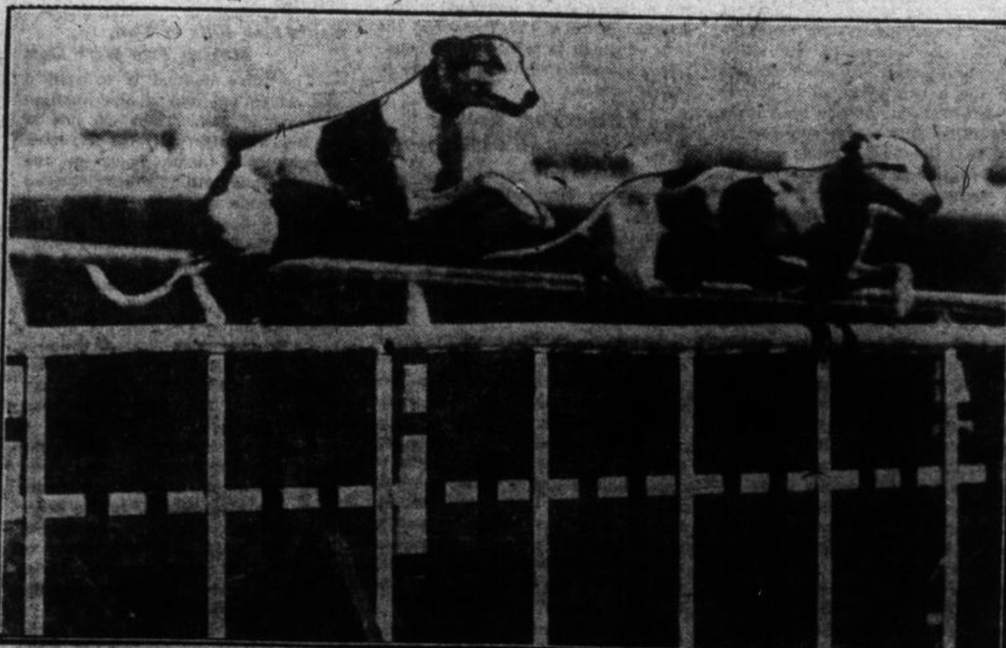
Faster than Zev, Epinard, My Own or Papyrus, these canine speed machines brought 5,000 shrieking race fans out of their seats during the greyhound races at Miami, where the dog running season is now in full swing.