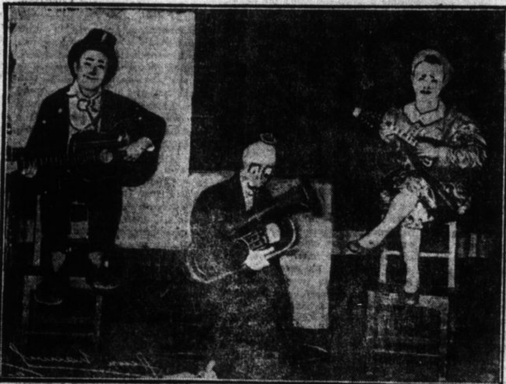
These famous Fratellini brothers have recently been decorated with the French "Palme Academique" by the French minister of public instruction. They are the first clowns in the world ever to be thus decorated.