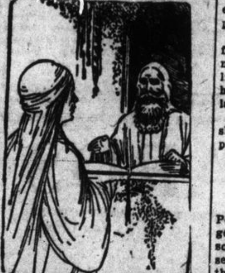
She Studied with the Buddhists. Her work, 'Isis Unveiled.' The volume contains a complete history of ancient and modern mysticism.