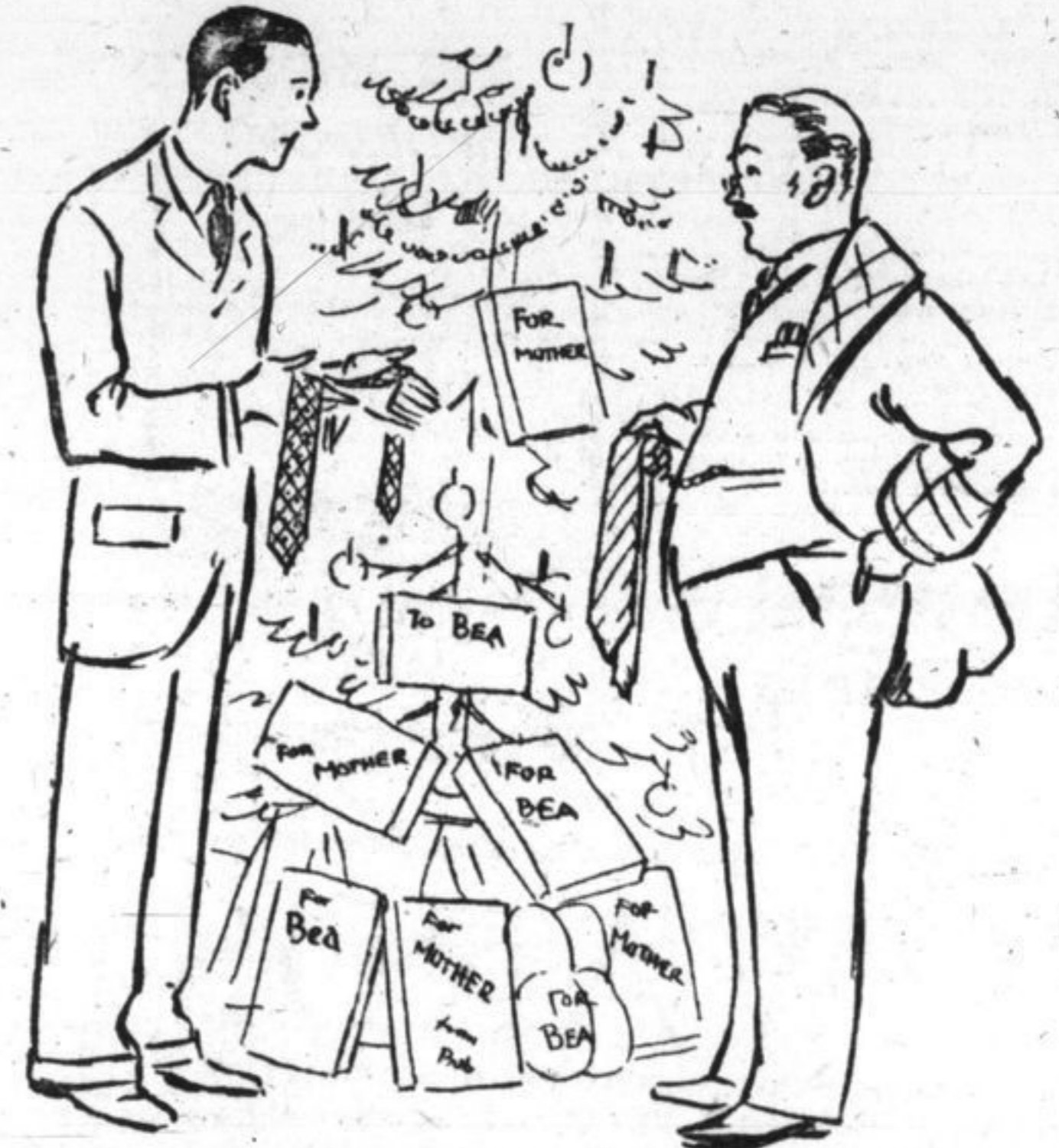
Good Will Toward Man?