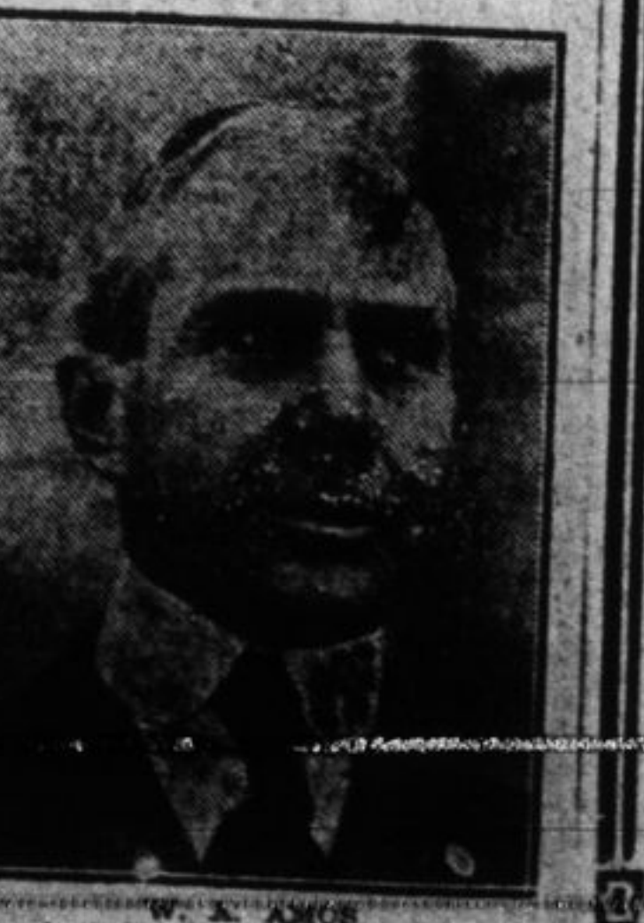
Re-elected President of the United Farmers of Ontario, for a second term. The programme of the U.F.O. calls for Dominion-wide prohibition and rigid enforcement of the laws already in force.

Forty convicts at the Portsmouth penitentiary are to be allowed out on parole, in the course of a few days. Their time would be up around March 1st, so they are being given three months off their sentence. This will reduce the number of prisoners in the penitentiary to 690.