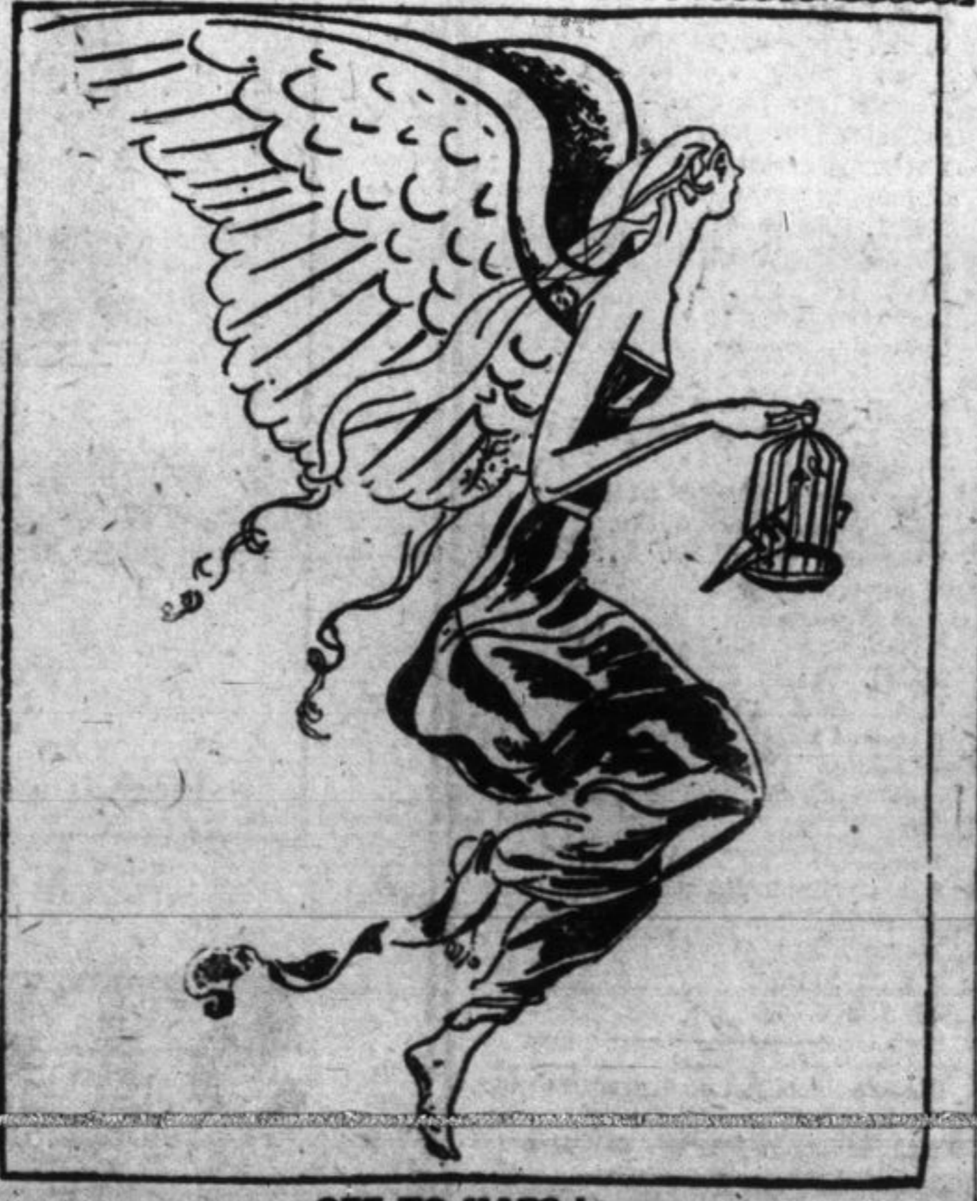
The Angel of Peace has decided that Europe is no place for her. —From the Tidens Tegn, Norway.

There is a new remedy that is very pleasant—it fills the nose, throat and lungs with a healing balsam from the pine woods, and utilizes that marvelous antiseptic of the Blue Gum Tree of Australia.