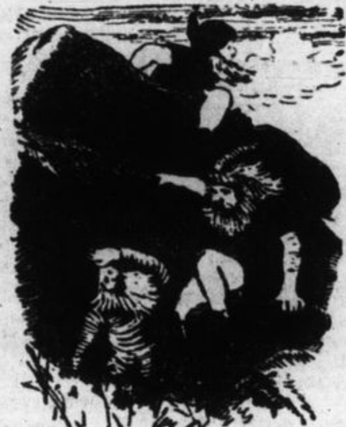
Elves were spoken of in Norse myths.

How Thor Got His Hammer. The Northmen believed in elves and dwarfs as well as in giants. The elves were supposed to be very small, and to dwell in caves and other secret places under the earth. Some elves were good, others bad. Elves enter an old story about Loki and Thor, two Norse gods. You have already heard of Thor.