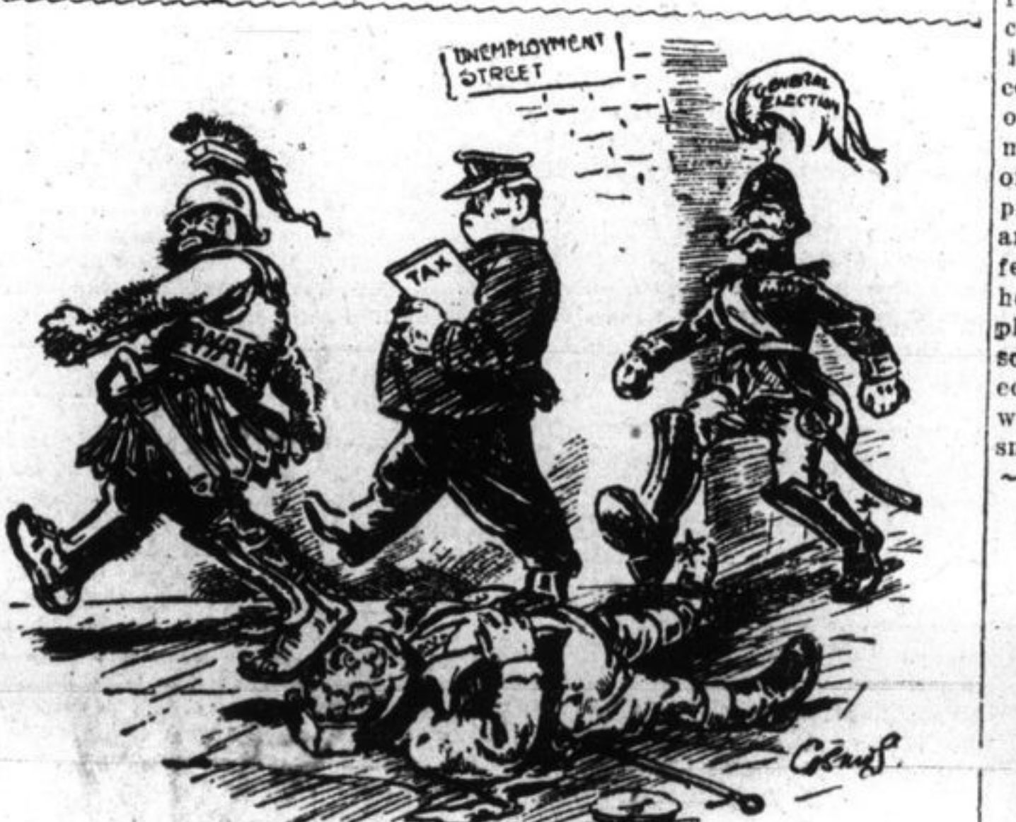
ONE DARN THING AFTER ANOTHER John Bull: "Step along, gentlemen, I'm getting used to it."