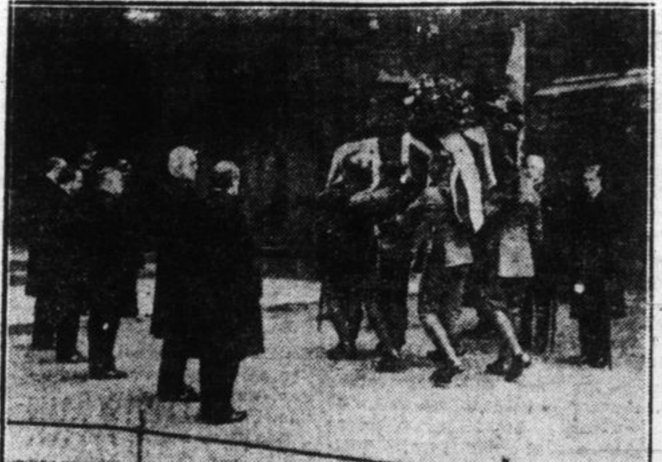
All the greatest political leaders of Britain united to act as pall-bearers for the funeral of Bonar Law. At the extreme right is the Prince of Wales and nearer the camera H. H. Asquith, Lord Beaverbrook and others.

Kingston "Kiddies" are writing their letters to Santa Clause. Old Kris Kringle certainly has a large family of little folk.