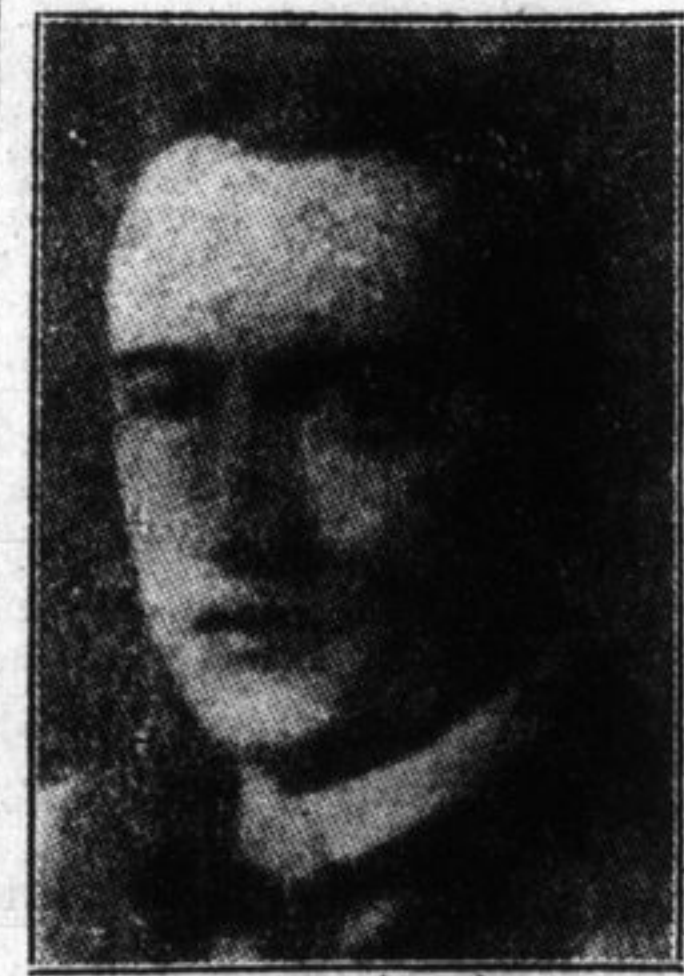
PREMIER STANLEY BRUCE of Australia, who is coming to Canada from the Imperial conference.