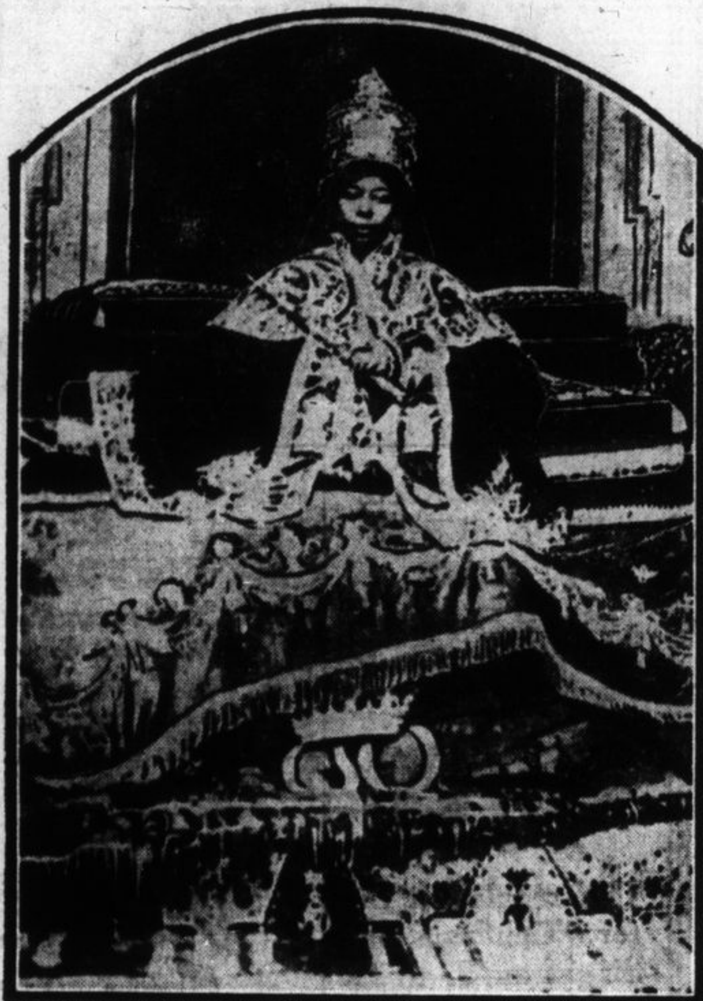
Abyssinia has been ordered by the League of Nations to abolish slavery within the empire if it would enjoy the benefits of membership. The empress, shown on her throne, has promised to comply