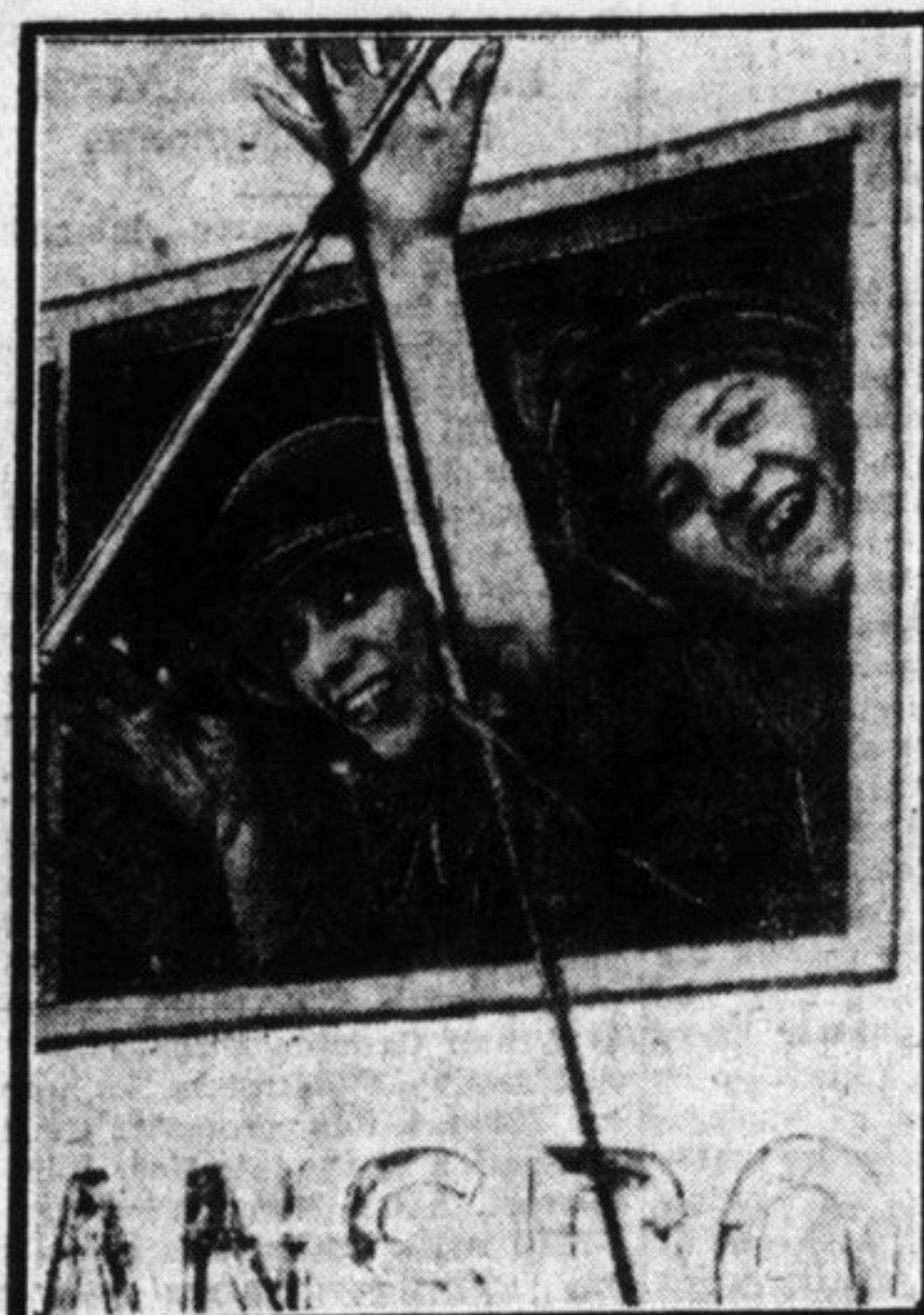
Fourteen waitresses from various restaurants in London left on a specially chartered aeroplane for a week's holiday in Paris. Photograph shows the girls just before leaving