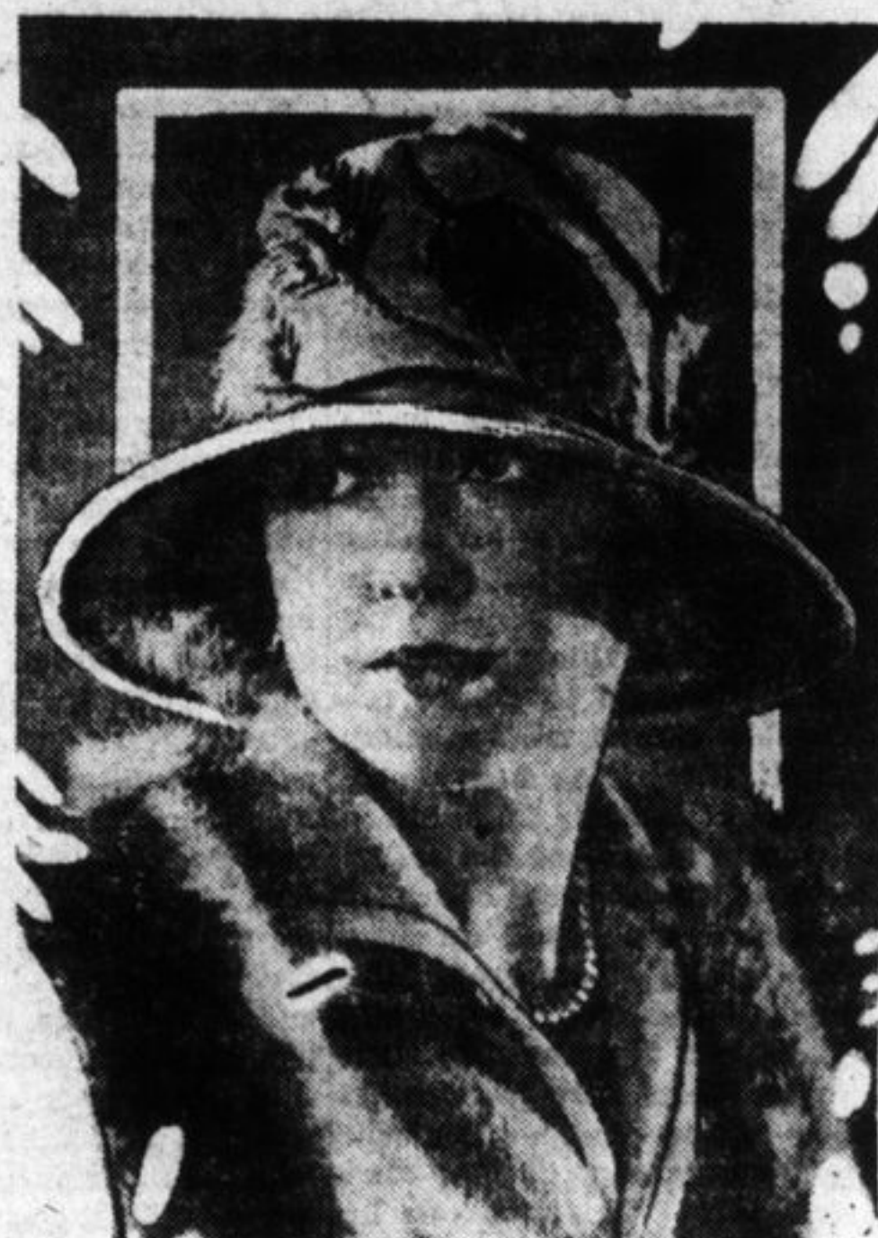
Felt hats will be worn extensively this season, says Dame Fashion. This one is adorned with the now-popular chenille, in attractive designs