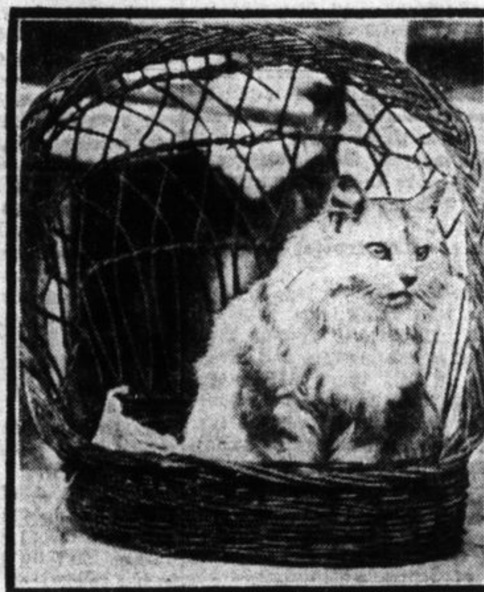
Washington boasts of a real cat hotel where only the highly-pedigreed Persian fluffs with long family names are allowed to register. The home has furnished society with blue-blooded kittens for many years