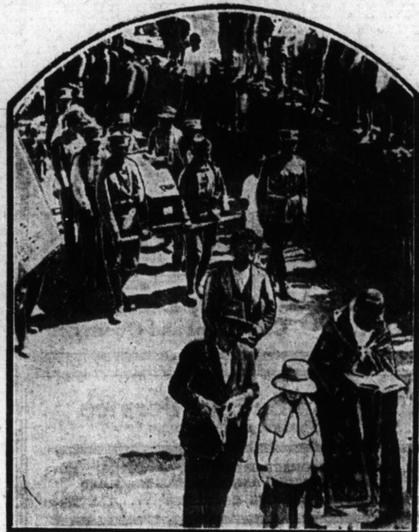
The coffin of one of the Italian mission, found murdered in Albania, is shown during the naval ceremonies in connection with the Greek apology to Italy