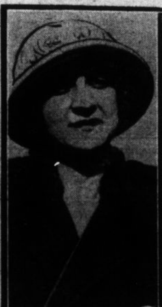
In her native Finland she is known as "The Mary Pickford of the violin." She is now in America on a concert tour and has proved herself to be a musician of rare charm