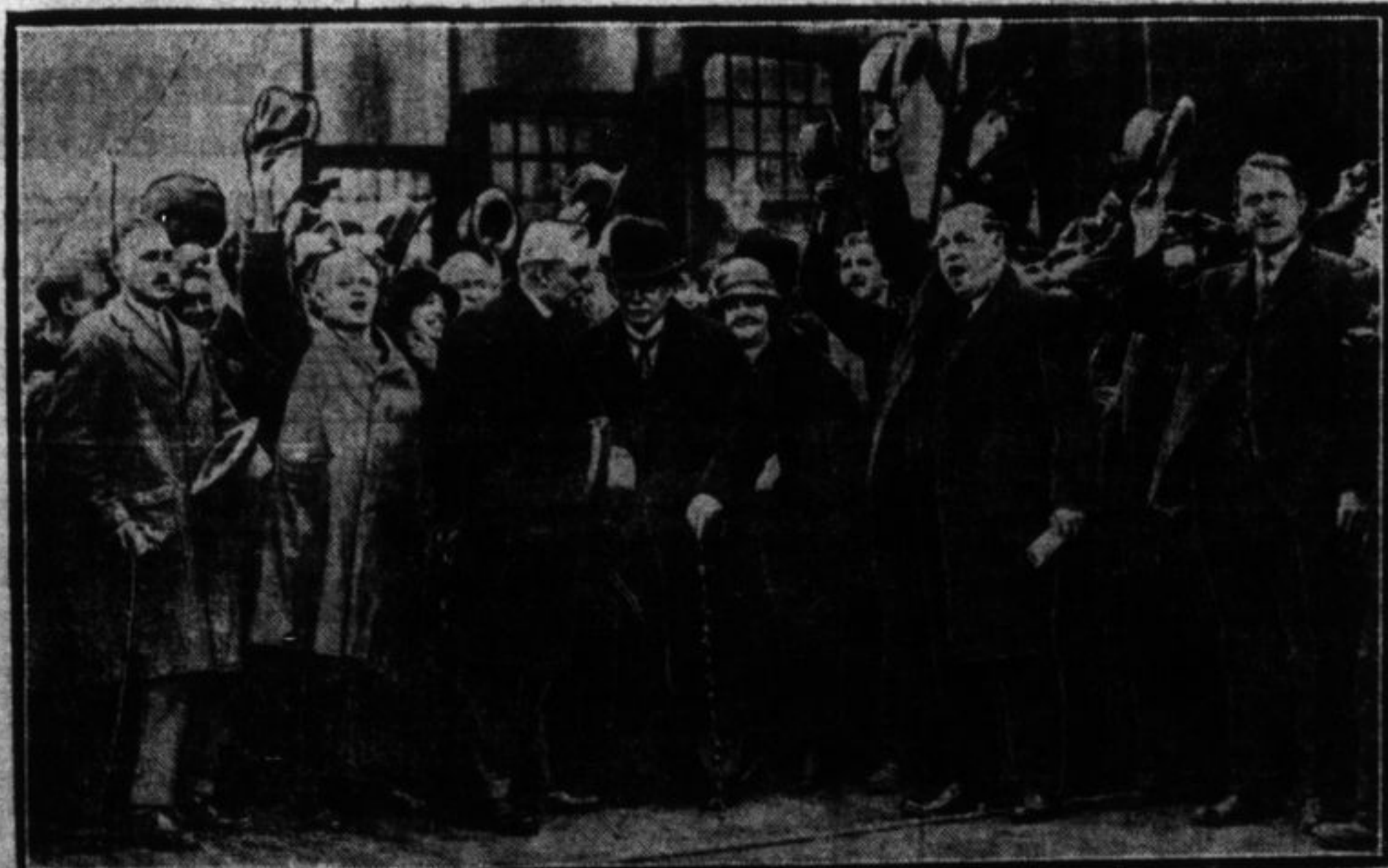
Lloyd George received a vociferous welcome on his arrival at the shops of the Canadian Pacific Railway at Montreal. The Little Welshman is seen being cheered by officials and men of the company on his arrival