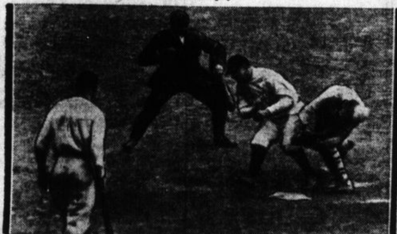
Following his drive for three bases, Babe Ruth was cut down at the plate by Frisch's great throw in the fourth inning of the first game of the world's series