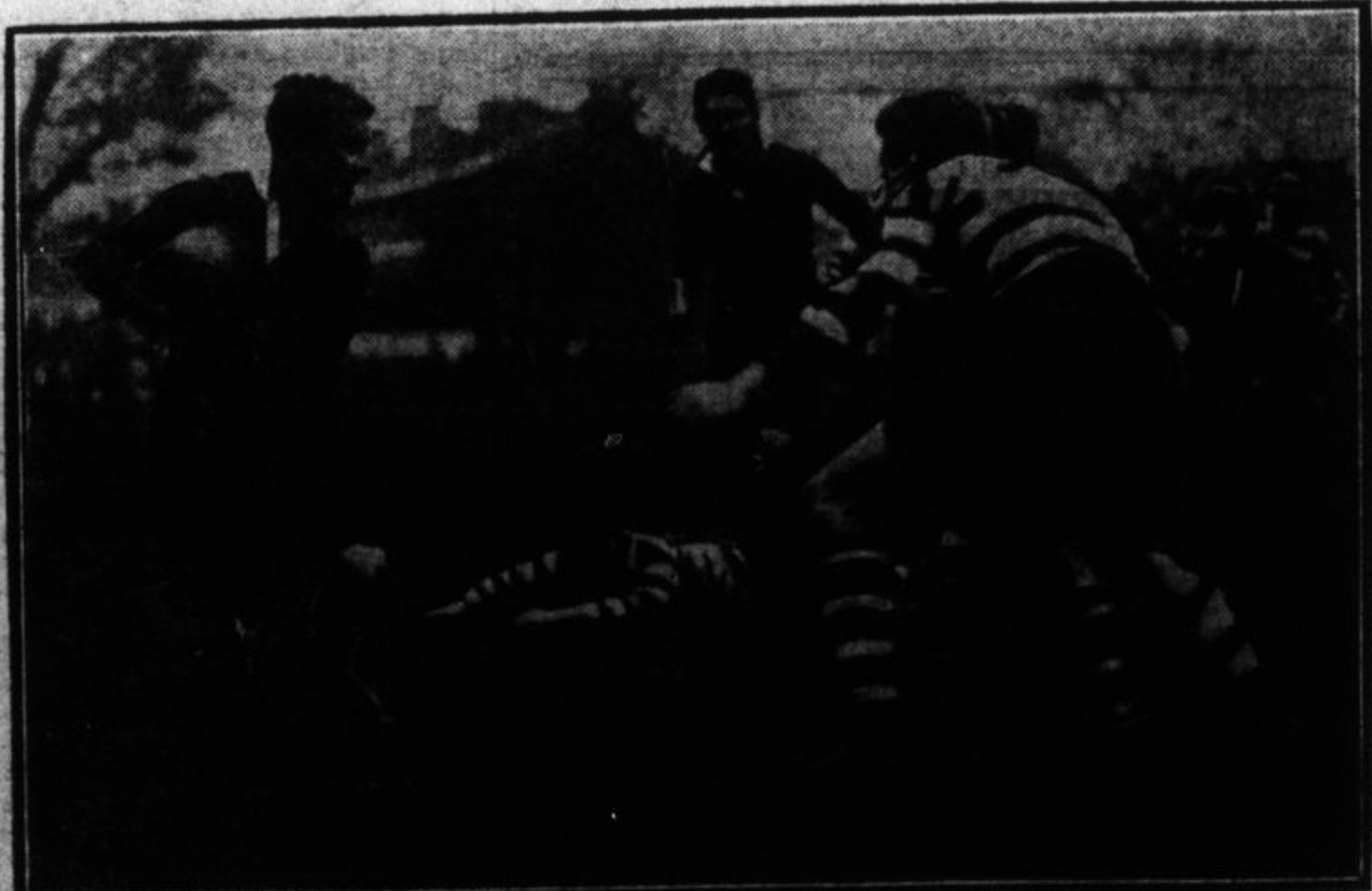
Blackheath met Rosslyn in the first battle to open the rugby season in England. A Blackheath player was snapped making a nice getaway with the ball