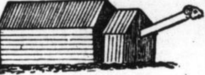
A Roman battering ram.