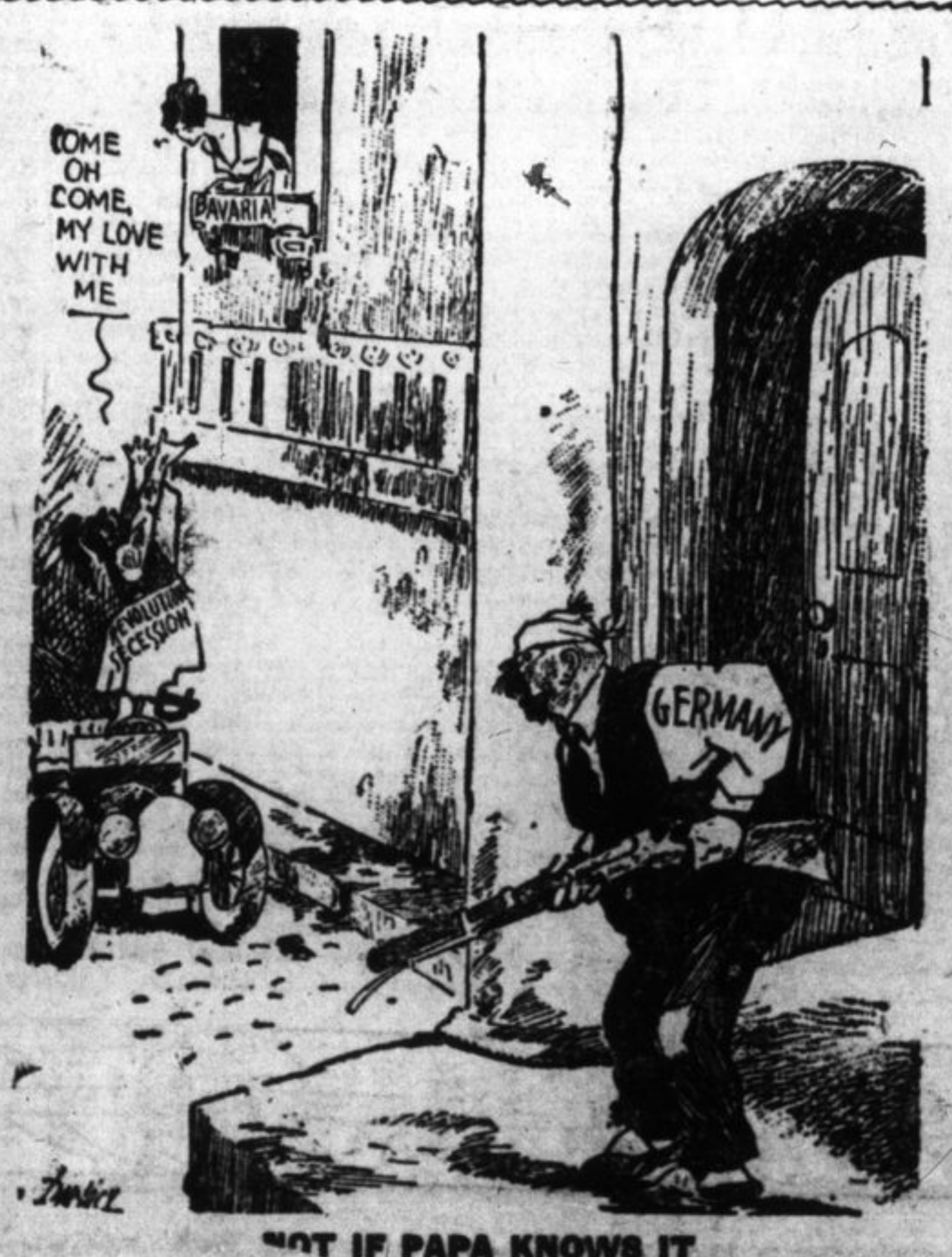
NOT IF PAPA KNOWS IT —From the Cleveland Plaindealer.