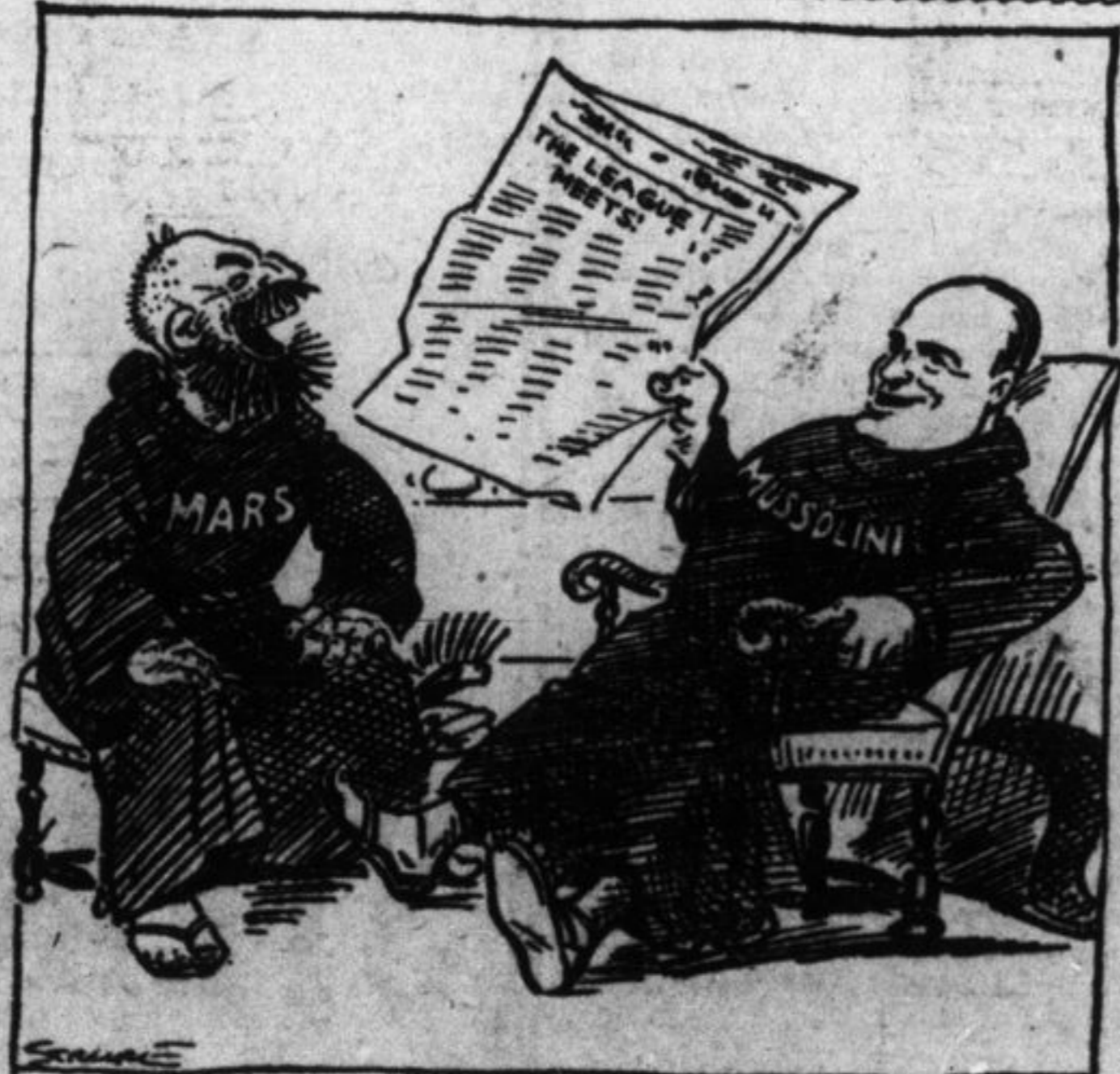
"A GOOD STORY." LONDON DAILY EXPRESS.