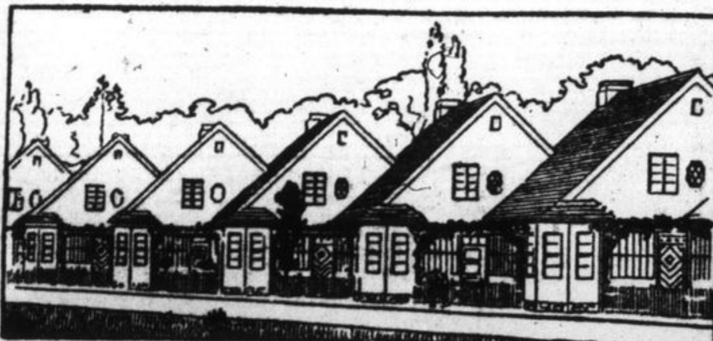
Small Dwellings Set at Angle to the Street to Give More Light and Air and Greater Security against Insects: Heat and Electricity are Supplied from a Central Plant