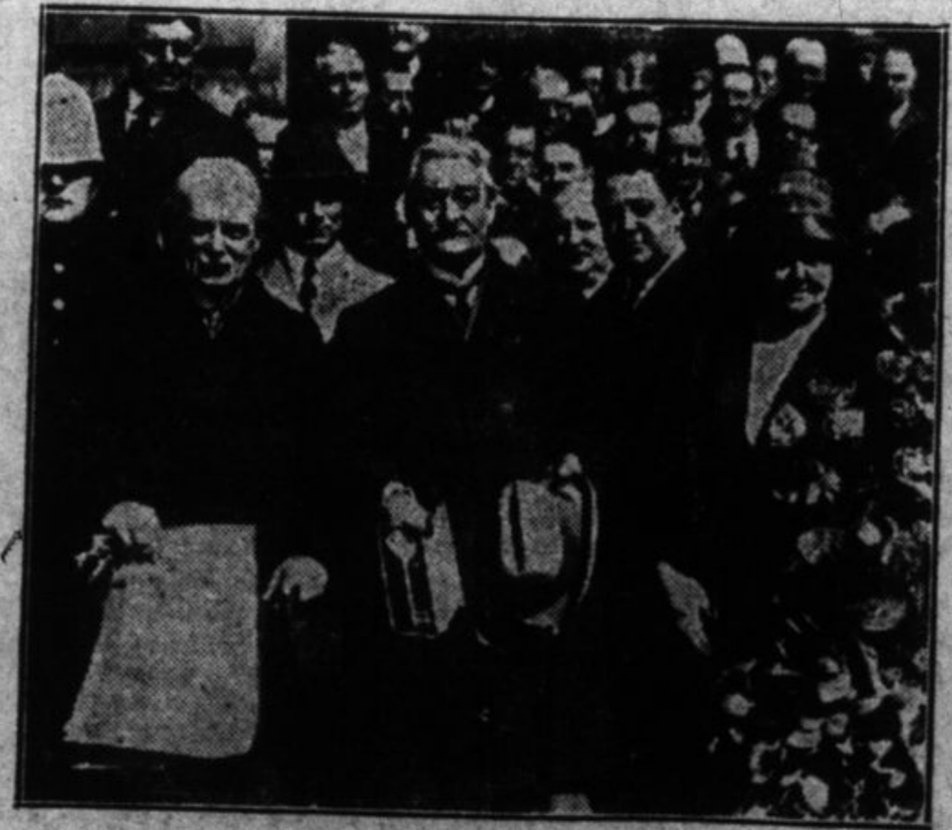
LLOYD GEORGE PRESENTED WITH KEY TO CITY OF MONTREAL.