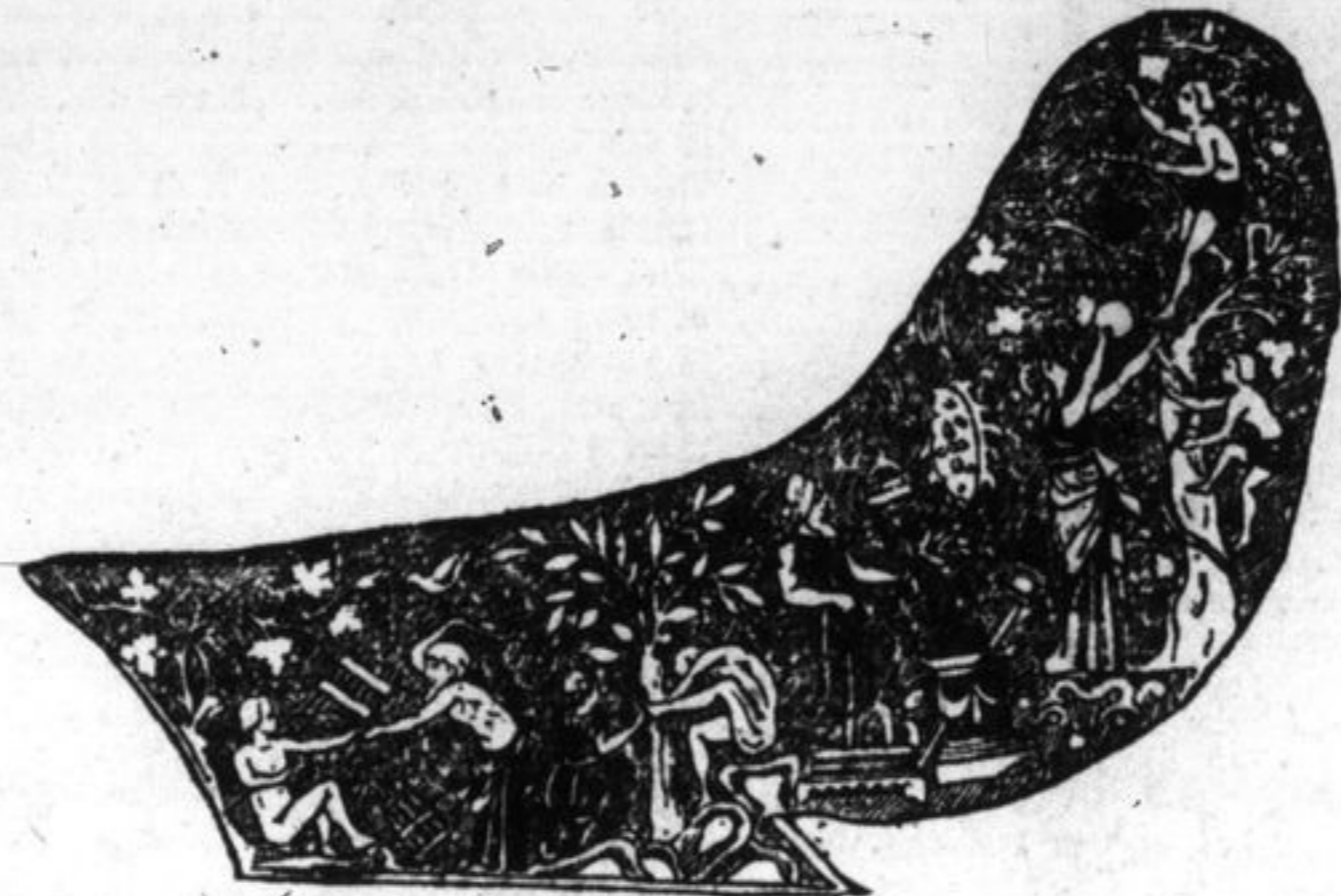
This picture shows slaves at work on a Roman farm. To the left a slave is receiving a beating.

The Slaves of Rome. It was dangerous for people to walk along country roads in Italy during early Roman times. There was no telling when a band of slave-traders might swoop down and capture wayfarers. Thousands of men, women and children were taken as slaves in this way. Sometimes pirate ships would land near a city and carry off whomever they could catch. Rich Romans complained. "Sometimes these pirates take children of the best families and sell them as slaves." It often happened that a poor citizen fell into debt. Hard as he tried, he could not pay the money he owed. Then he was sold as a slave. In some wars the Romans got tens of thousands of prisoners who became slaves. All the rich families in the city had large numbers of slaves. The master could put them to death if he wanted to, but he seldom did so because slaves were worth money. Beatings, however, were common. There were several slave markets in Rome. The unhappy persons who had been captured were sold at auction. They were trotted around as if they were animals for sale. The usual price was between $50 and $1,000. (I am speaking in terms of American money. Of course the Romans used different coins.) Probably the hardest life was led by the slaves who worked on farms. From sunrise to sunset—or even longer—they toiled, picking grapes or olives, caring for herds, and taking care of growing crops. The whip of the overseer was often on their backs. Next—Out in the Country.