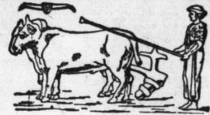
This picture shows an ancient Roman plow, drawn by oxen. Next—Rome Gets Tired of Kings.

People living on a third hill were soon added to the city. The Roman word for one-third was "tribus." Our word "tribe" comes from that.