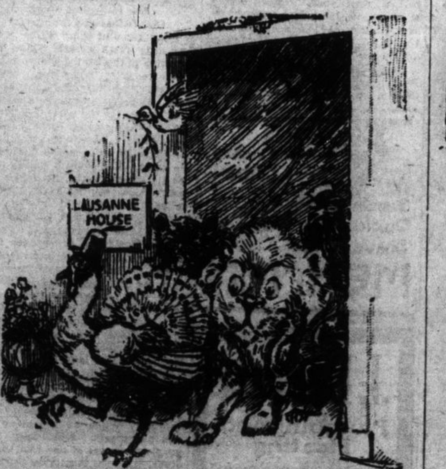
THE LATEST TURKEY TROT. Coming out of the Ark at Lausanne.—From The Glasgow Times.