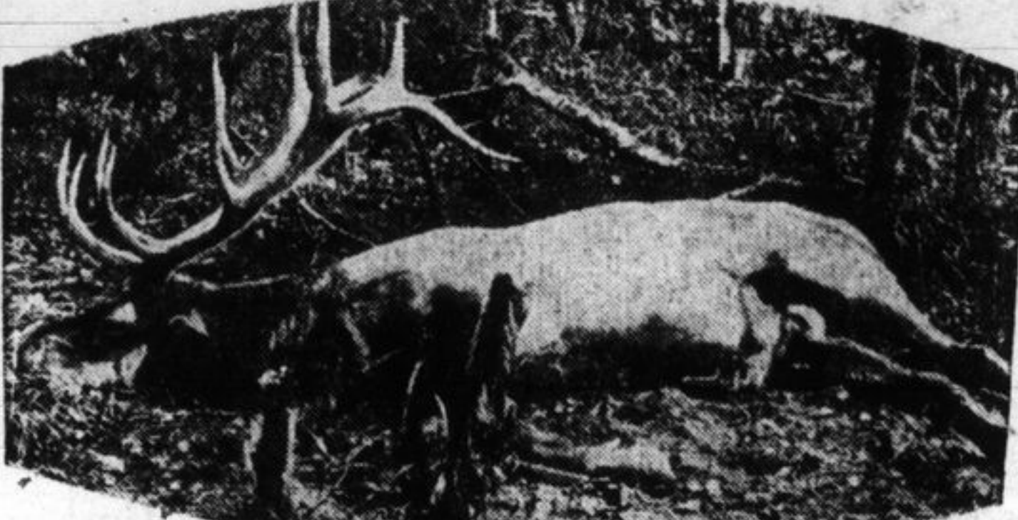
This huge elk cost the man who brought it down an $800 fine. It was singled out from among one of the large government protected herds on Vancouver Island on account of its fine spread of antlers.