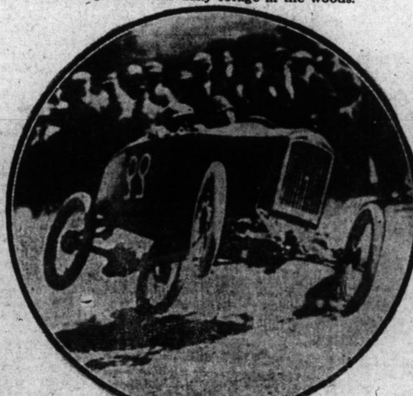
Rounding a sharp turn at a 100-mile-an-hour clip, one of the competitors in the recent Mount Ventoux motor race in France has a narrow escape from upsetting.