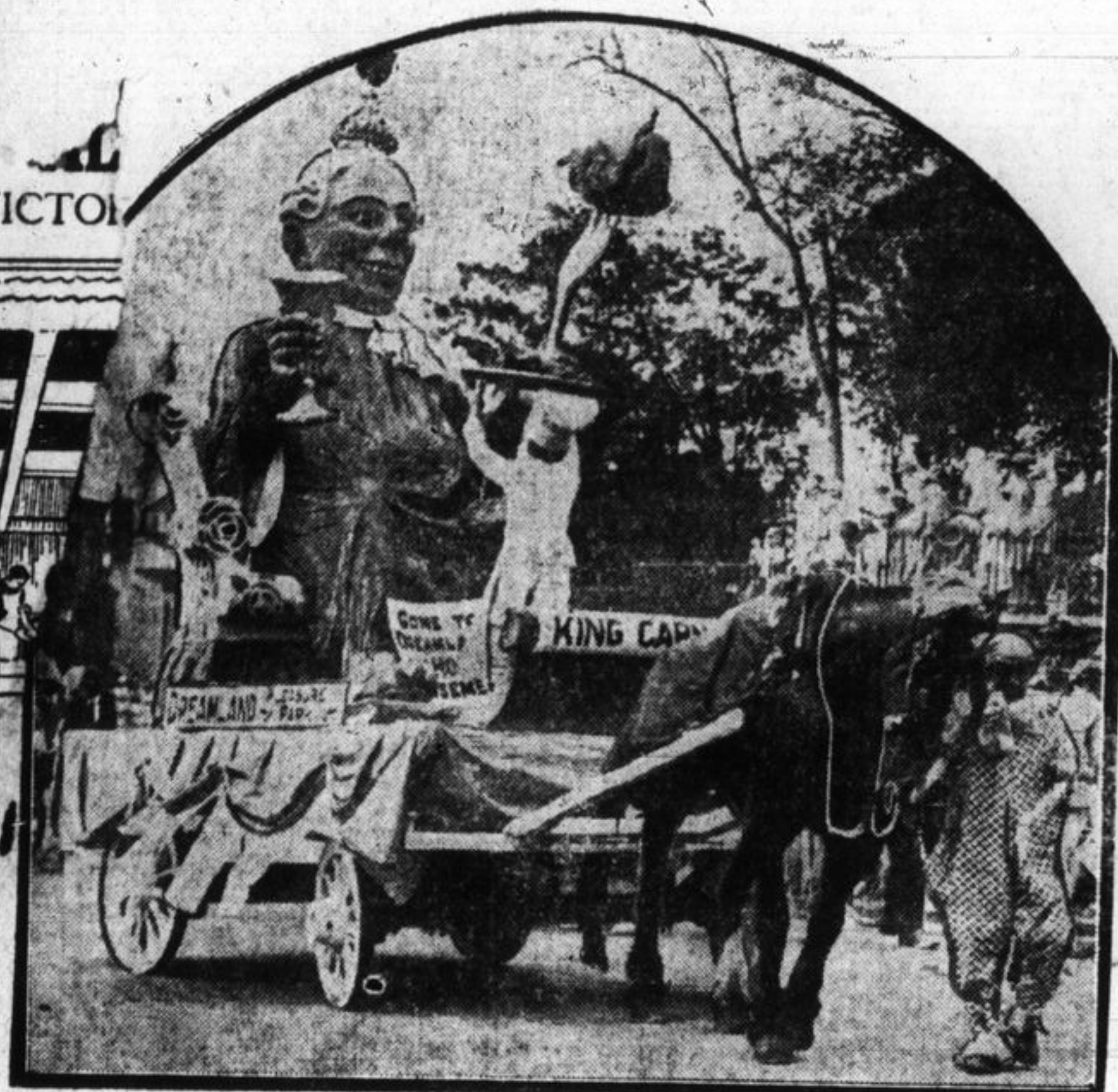
Carnival week at Margate, one of England's famous sea-side resorts, is a time for gay festivities. Here's a float that made a hit.