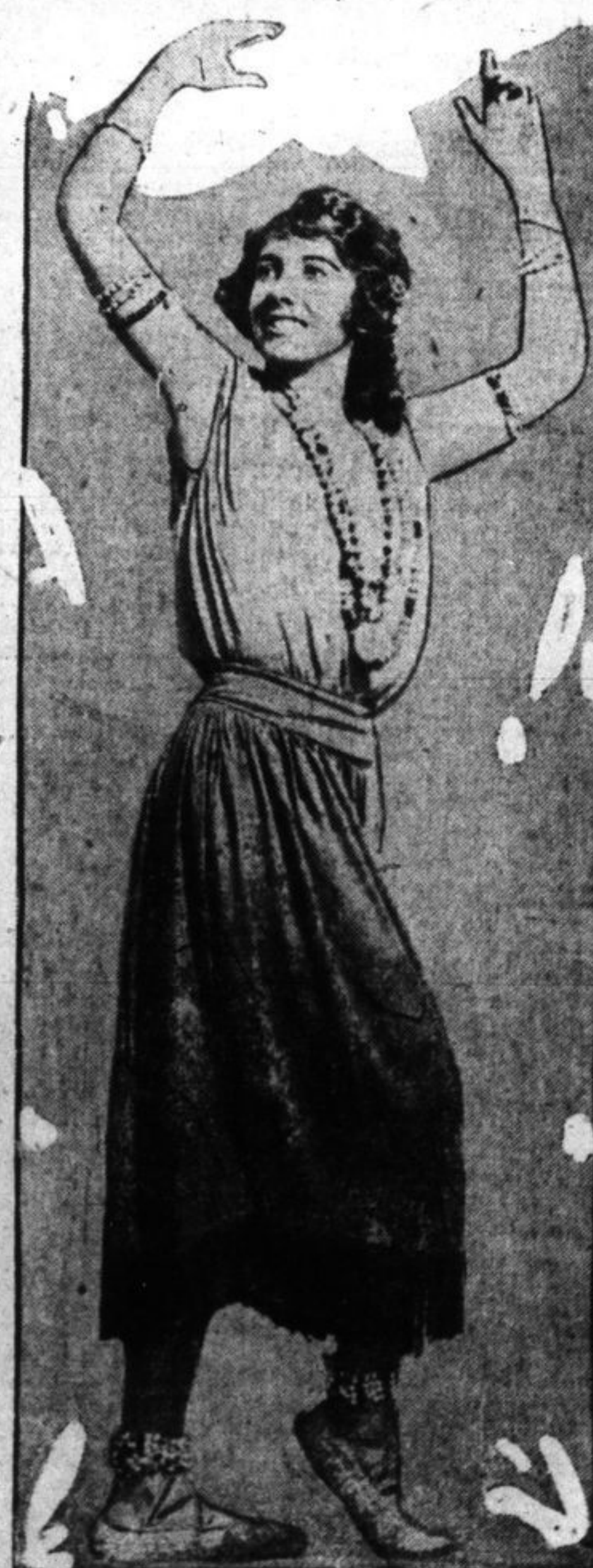
This striking young South Sea Island dancer has been brought over to America for a tryout on the silver screen.