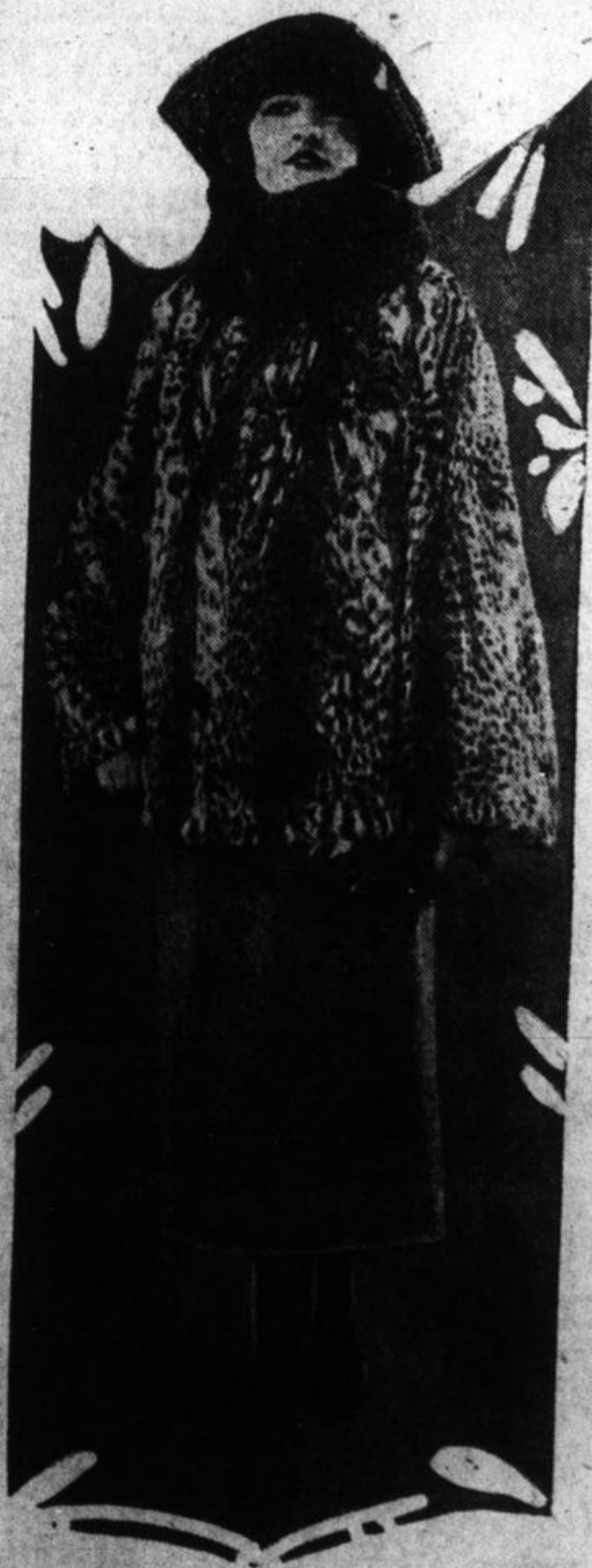
Here's a chic sport coat of baby leopard fur, with upright seal collar, that stands out among the new fall and winter models.