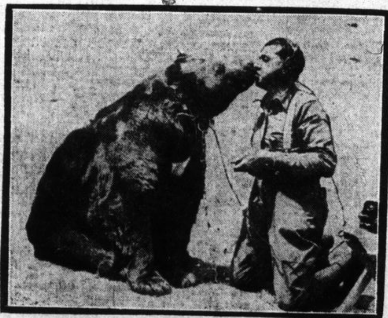
A sentimental song on the radio makes bruin feel affectionate. It will go hard with Bud White if he starts in hugging.