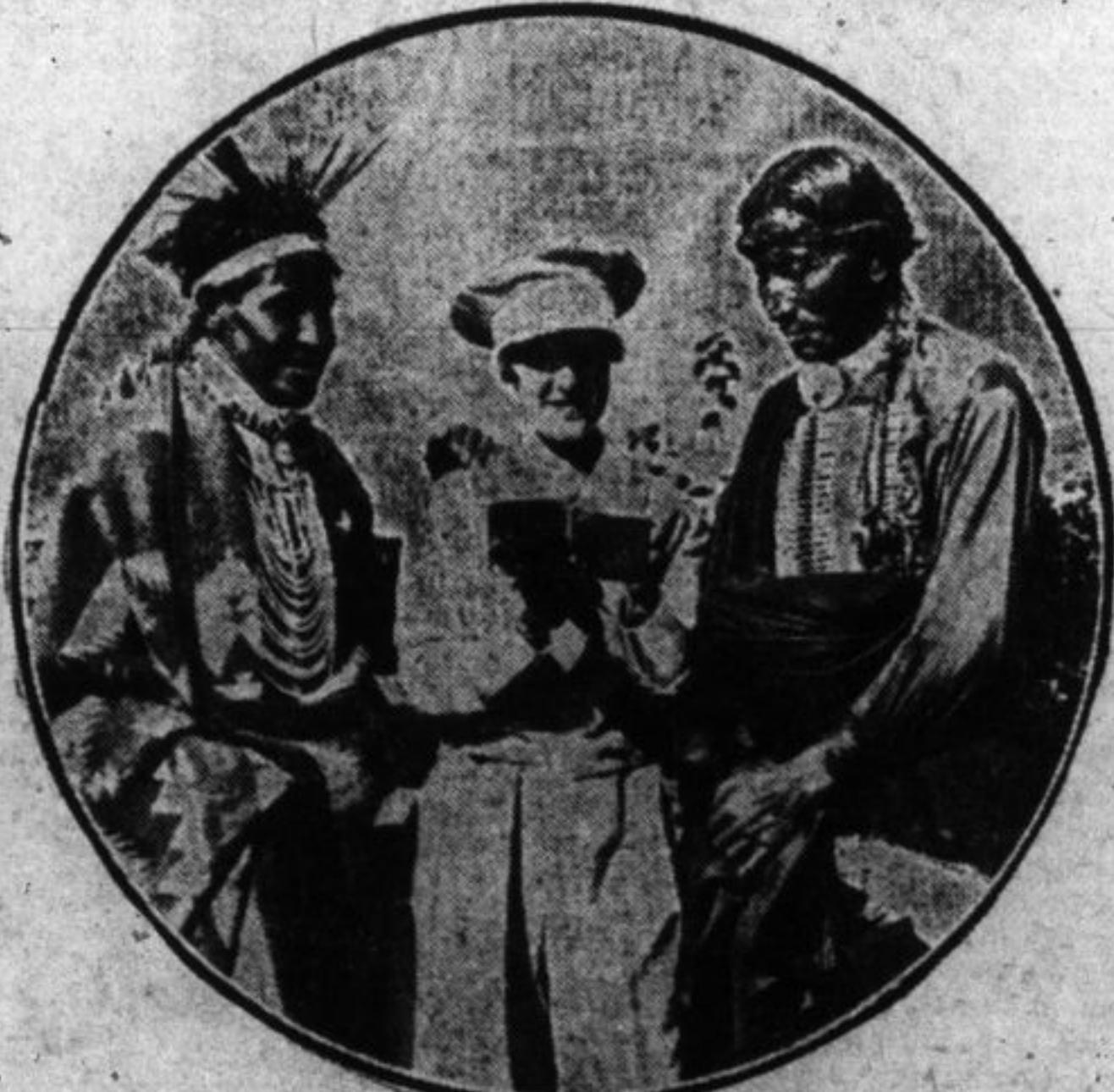
London had a chance to see some real full-blooded American Indians last week, when these two Blackfoot chiefs arrived on the scene to advertise an American play.