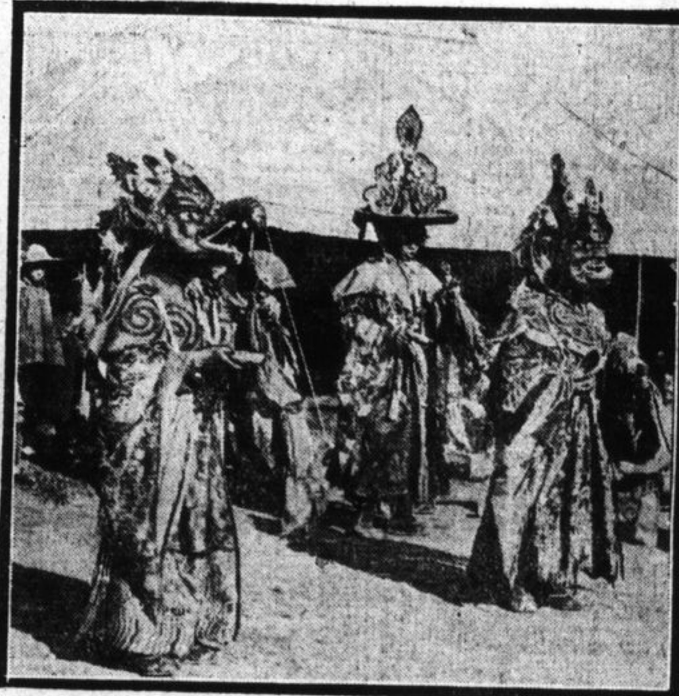
These hideous Mongolian figures are taking part in the famous devil god dance, with which the wild celebration of the Buddhist lent is brought to a close.