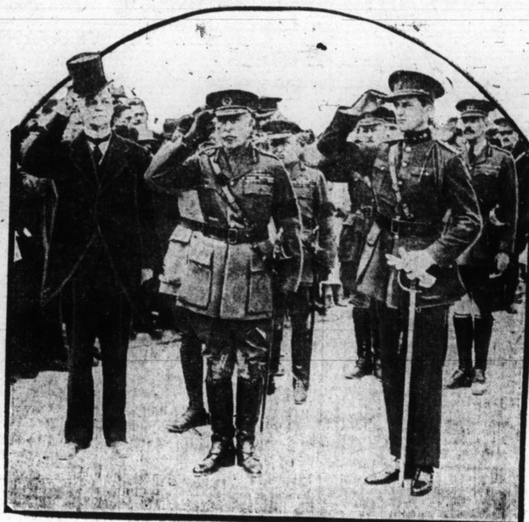
Field Marshal H.R.H. the Duke of Connaught (centre) officiated at the recent unveiling of a monument to commemorate Canada's glorious part in the 2nd battle of Ypres.