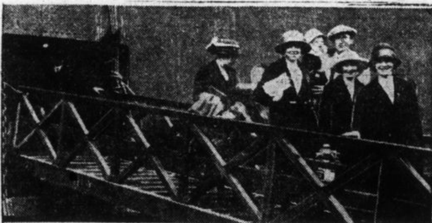
Are we downhearted?—the smiles speak for themselves. It is a bunch of new British settlers for Canada landing at Quebec. They seem exceedingly well pleased with their first view of the land of the maple leaf.