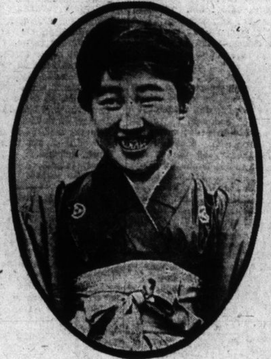
Princess Yoshiko, a member of the royal family of Japan, which is reported to have lost heavily in the terrific earthquake of September 1.