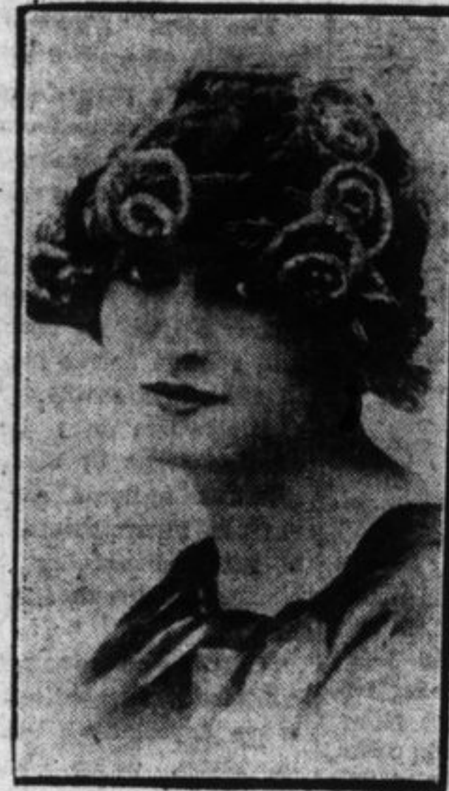
The small shape worn off the face is said to be the latest for milady's fall millinery.