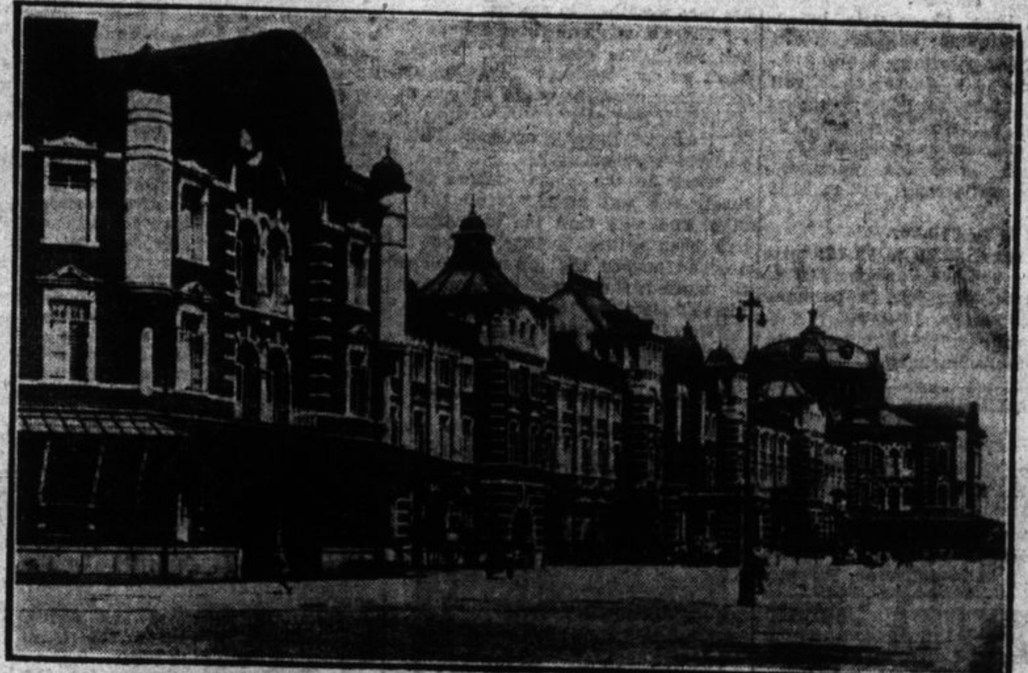
The Central Railway Station of Tokio is now a mass of ruins as a result of the earthquake and fire.