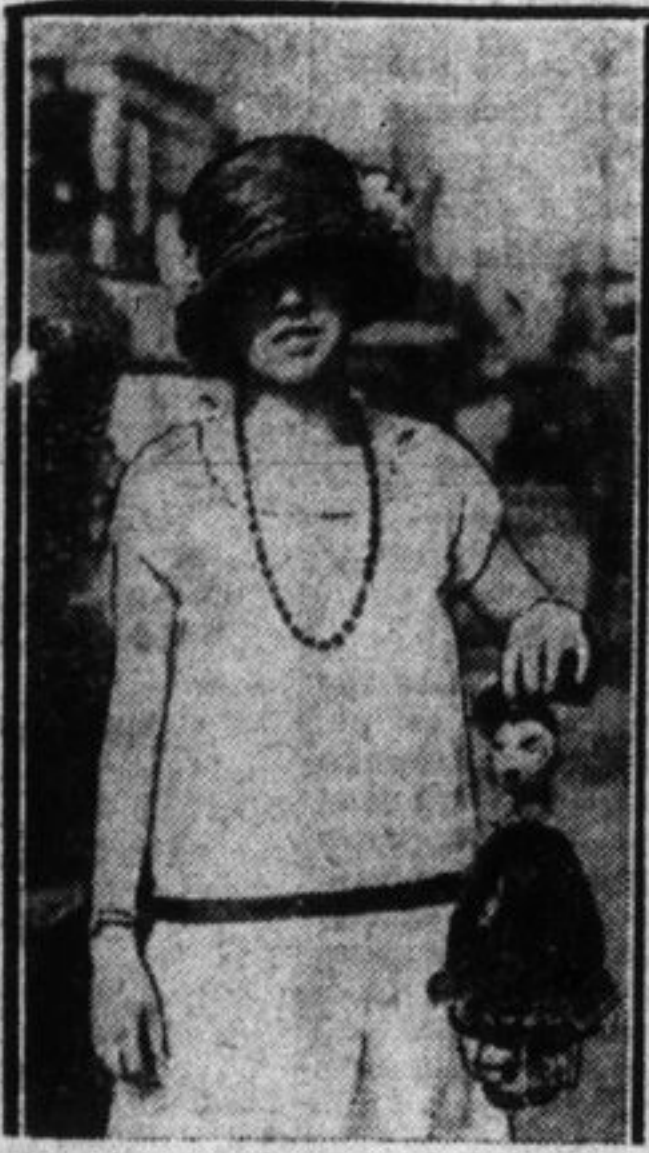
The Chinese doll—something new in handbags as being carried on the streets of Washington.