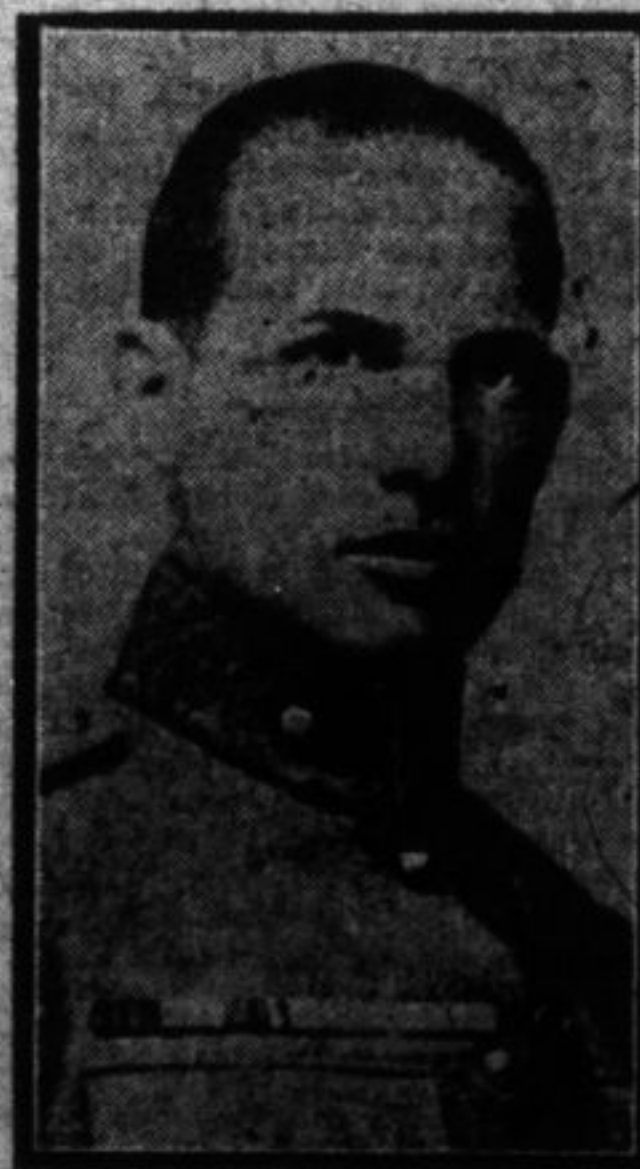
King George of Greece, whose country is faced with the possibility of submitting to the humiliating conditions imposed by the Italian government.