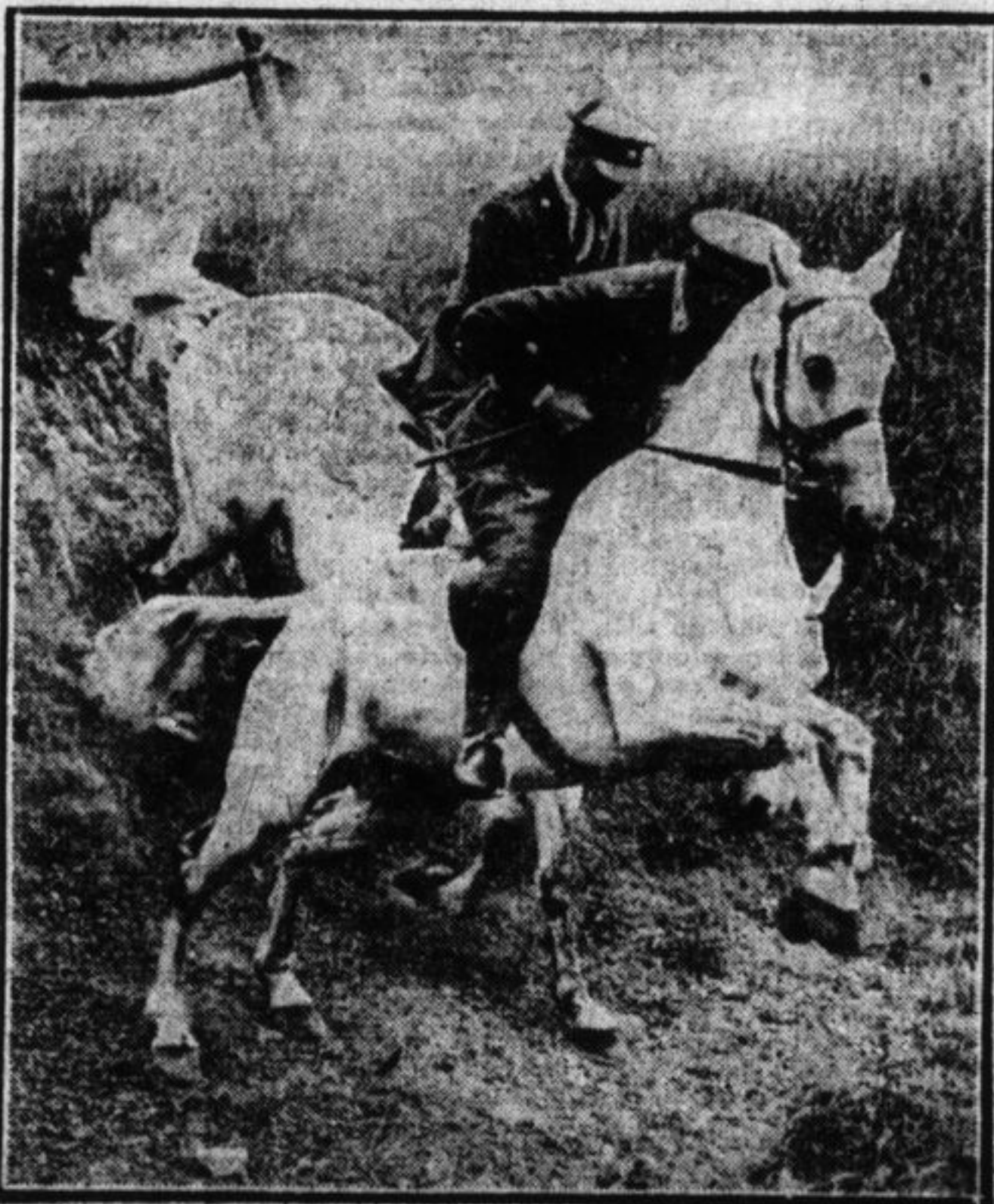
British cavalry officers learning how to cover rough country at the equestrian school, Weedon, Northants.