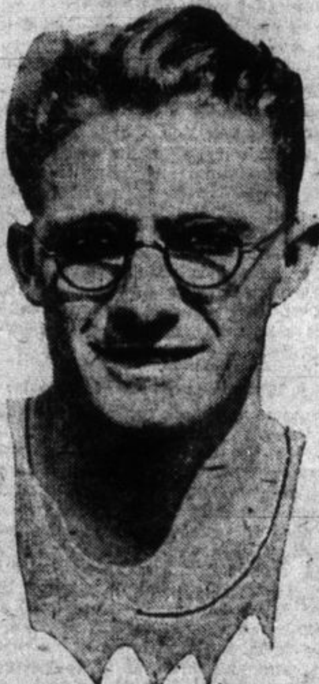
Harold Osborne, said to have won the right to be called the world's greatest athlete through his success at the recent national A.A.U. meet in Chicago.