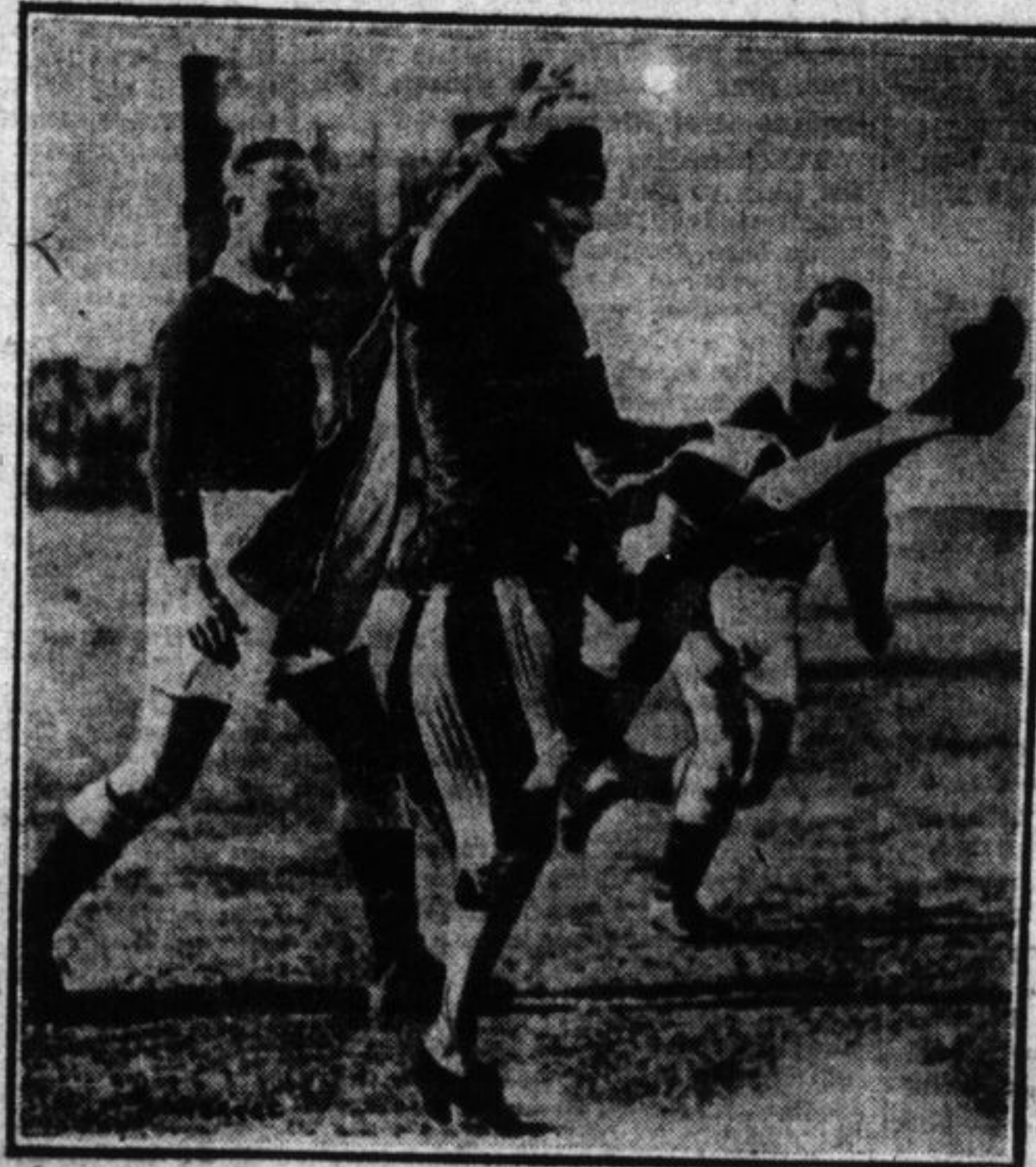
Annette Kellerman, known the world over as the "perfect figure" and champion diver and swimmer, kicks-off in a recent big football match in Sydney, Australia.