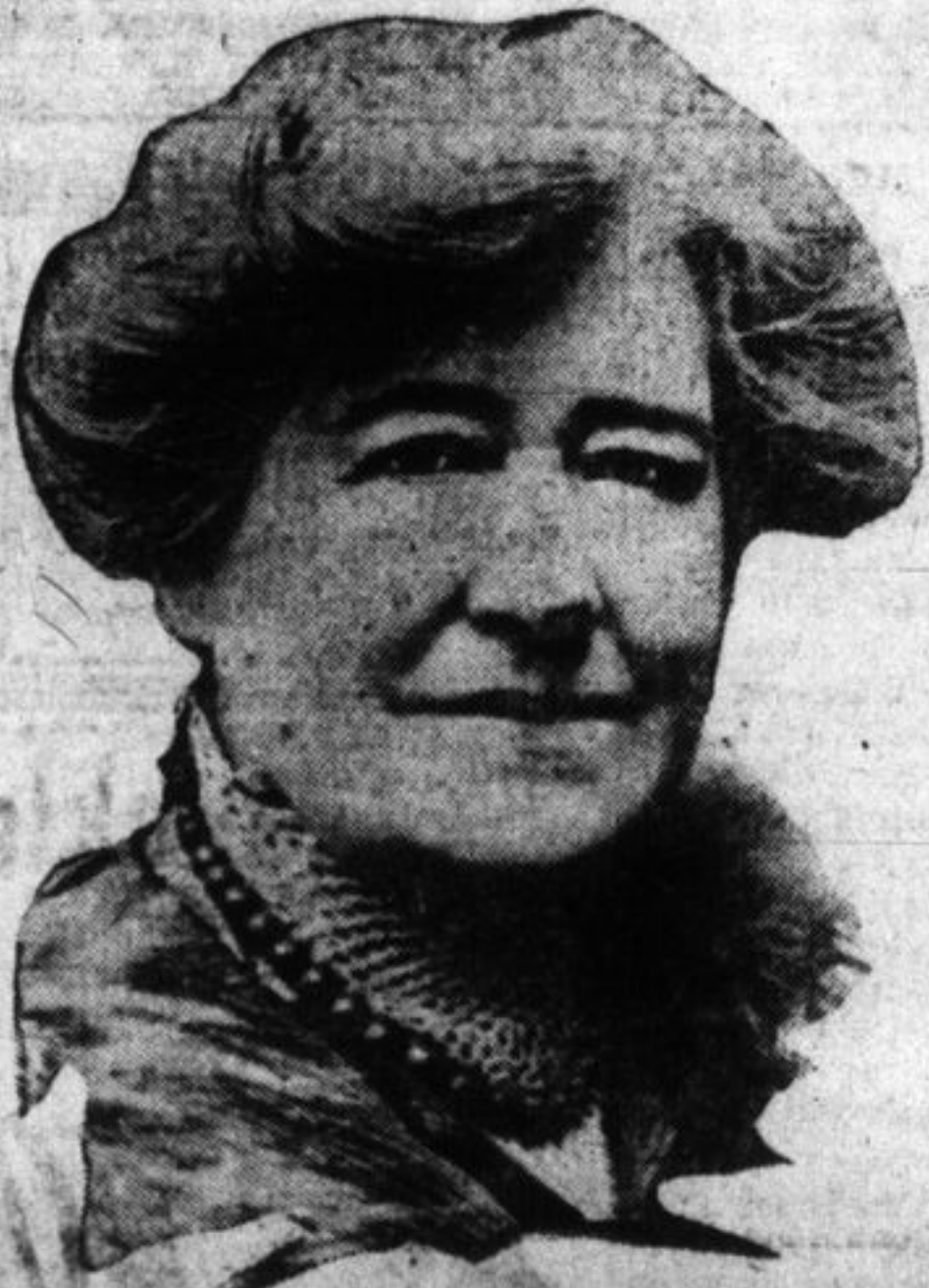
Ellen Terry, England's famous Shakespearean actress, as she appears in home life.