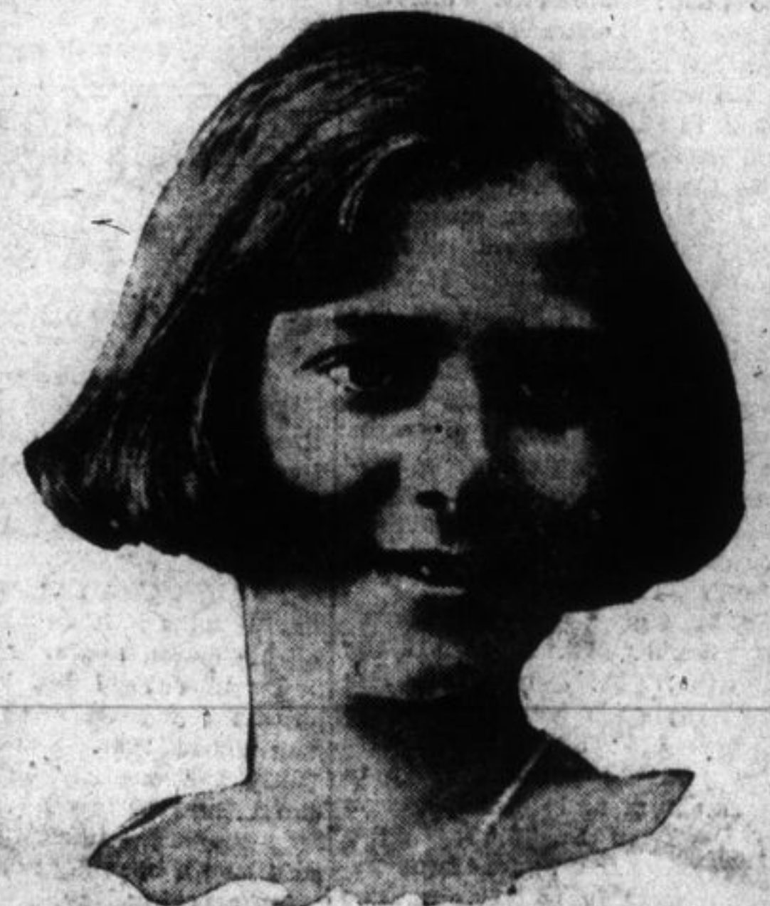
Princess Elena, youngest daughter of the Queen of Rumania, who was once looked upon as the possible future queen of England. She is now reported engaged to King Boris of Bulgaria.