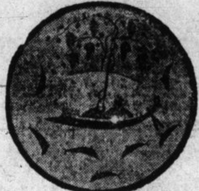
The wine-god riding with grapes above him.