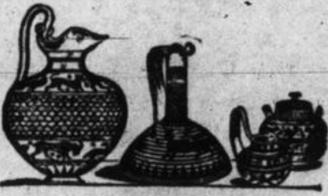
Pitchers and vases of the Greeks.