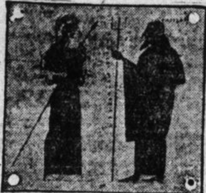
Athena and Poseidon.