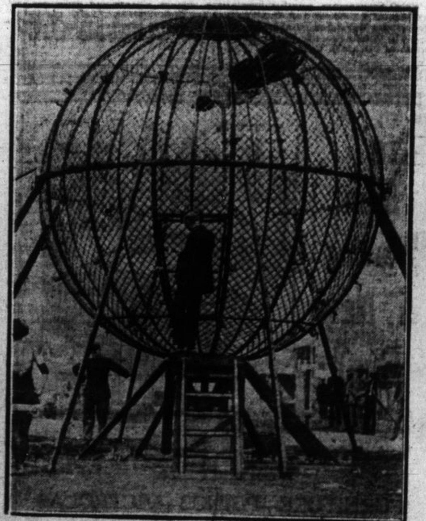
This motorcyclist defies the law of gravitation as he spins around the huge steel ball before the grand stand at the Canadian National Exhibition.