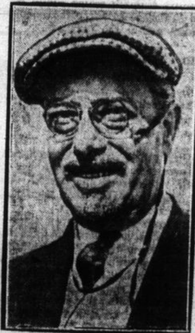
George W. Peck, the original and only "Peck's Bad Boy," as he is to-day. It was his escapades as a boy that gave material for a book.