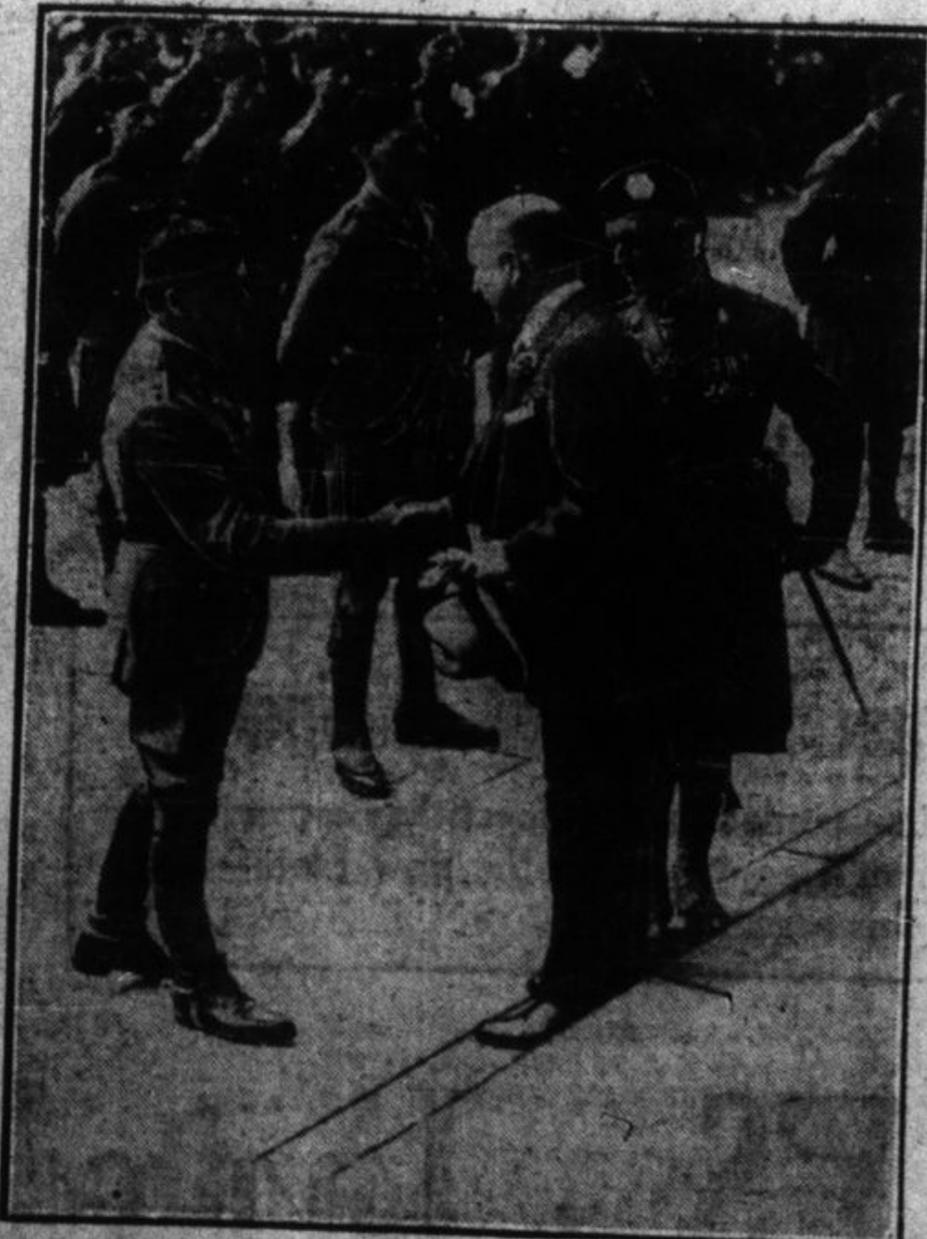
Detachment of London Scottish, now in Toronto as guests of the Canadian National Exhibition, are seen being welcomed to the city by Mayor Maguire.