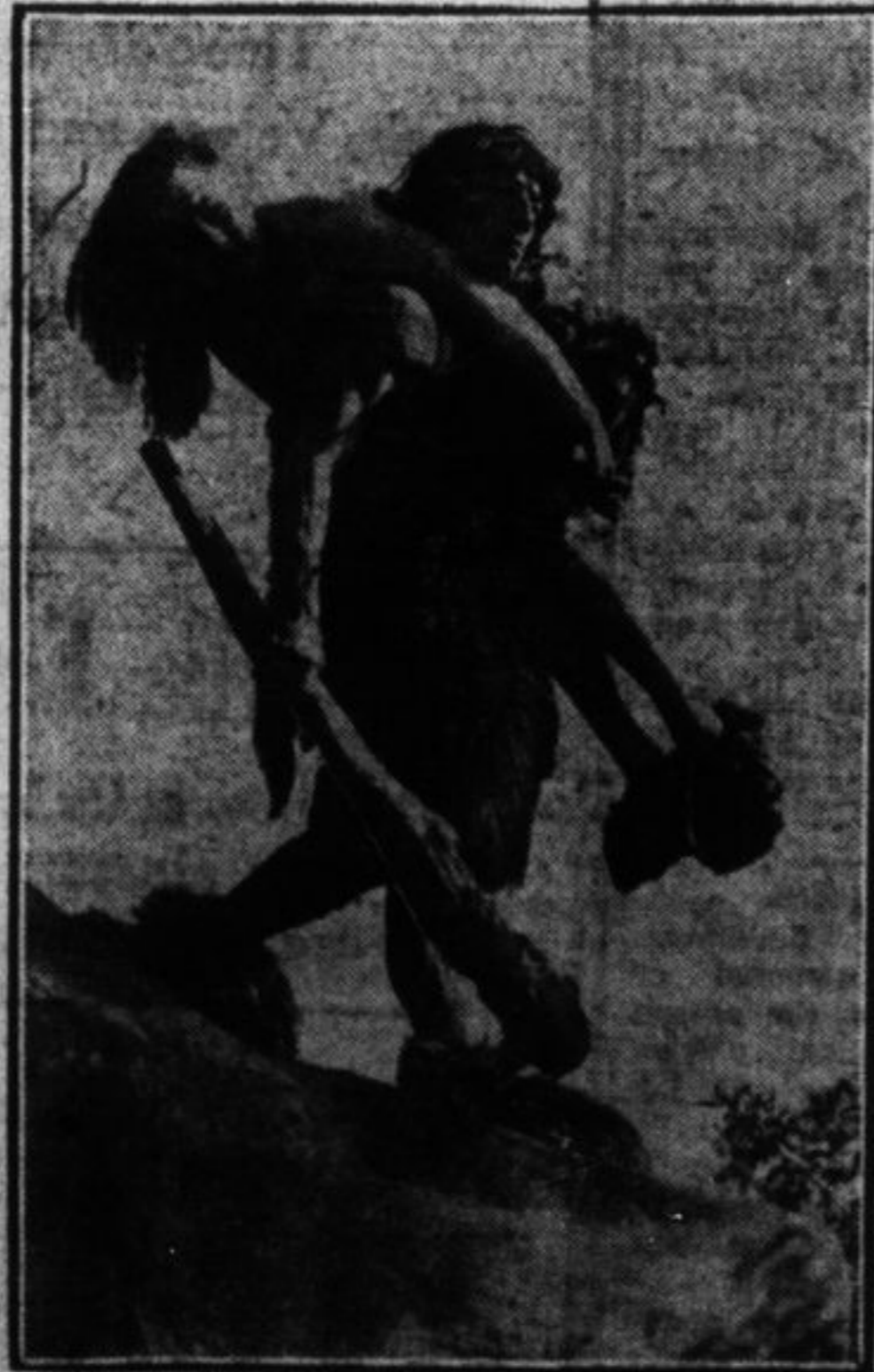
Here's a real live cave man who uses Loch-invarian stunts to capture his bride. Do you recognize these faces of the movie world?