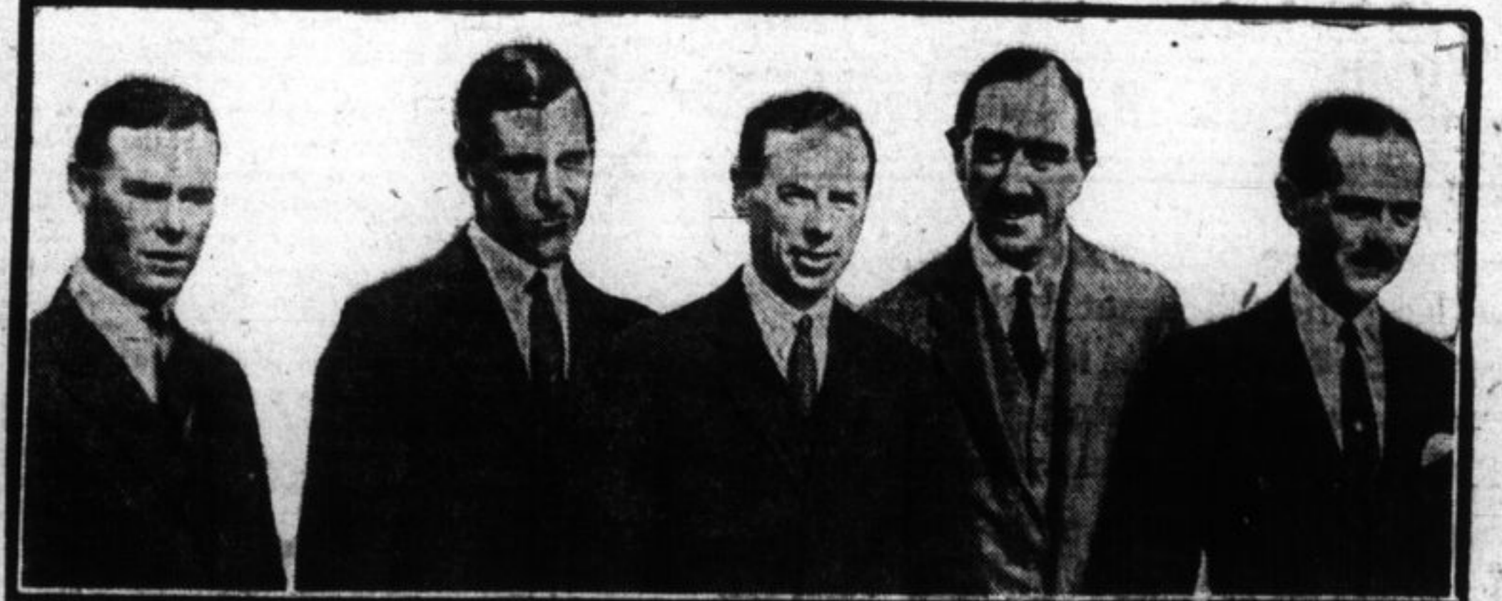
The British army polo team have arrived in the United States to compete in the international military polo championship.