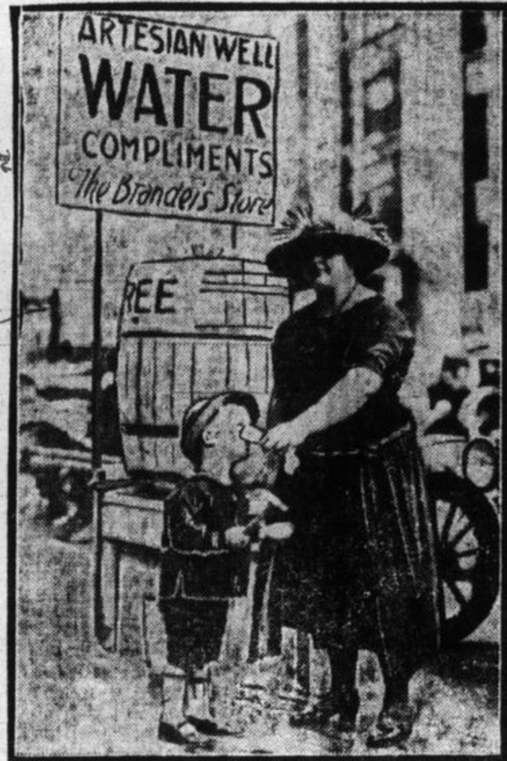
Omaha, Nebraska, is slowly recovering from a crippled water system caused when the mud banks on the Missouri were carried away near the intake of the city water system.