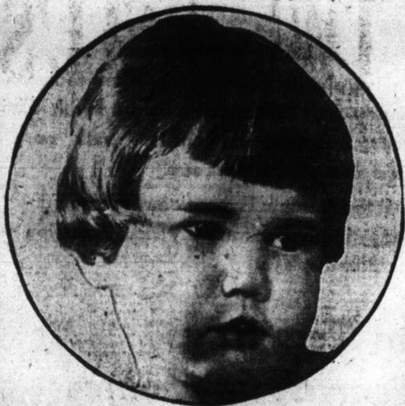
Baby Peggy has just signed a contract that will ensure her at least $1,500,000 a year for the next three years for her share in the movies.