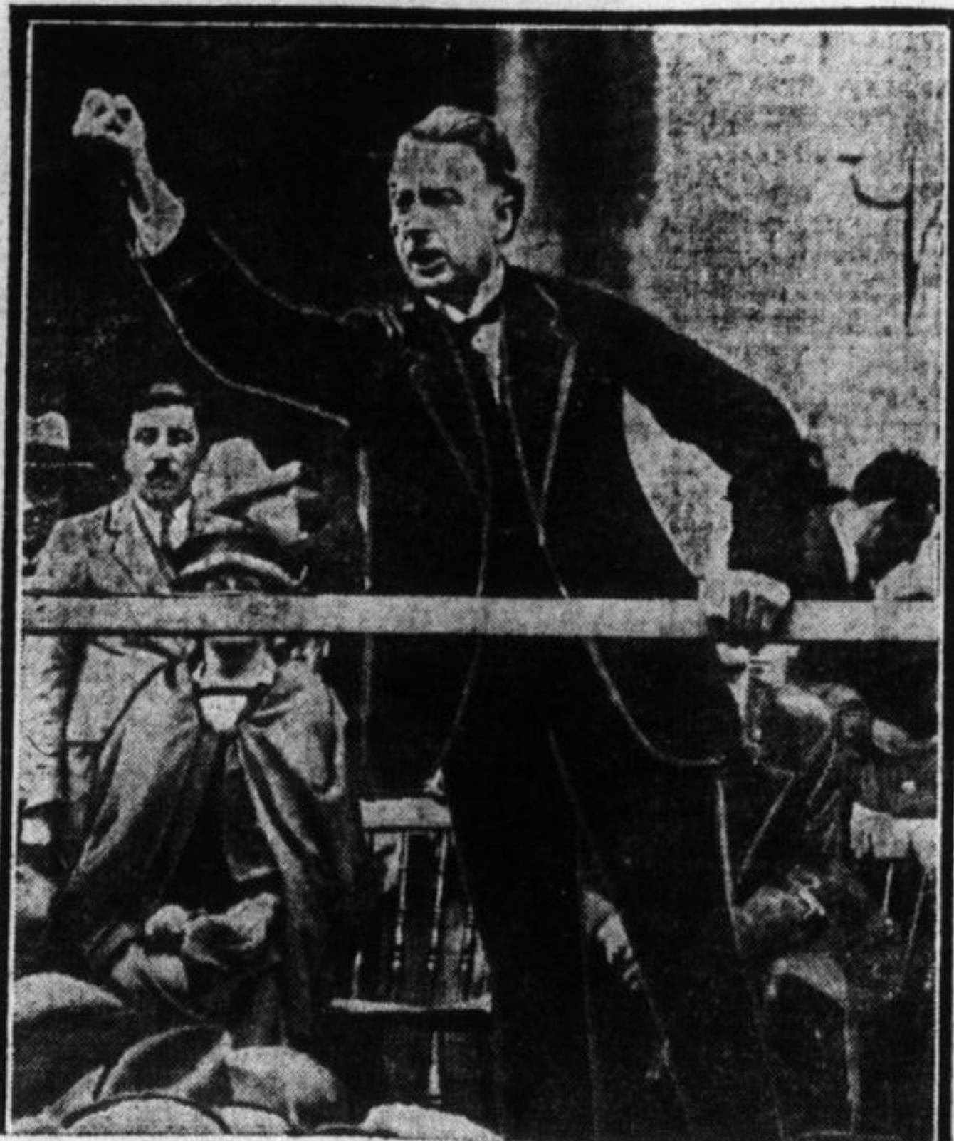
Here is a striking picture of President Cosgrave of Ireland in a striking pose. He is seen addressing a crowd at the College Green, Dublin, prior to the elections.