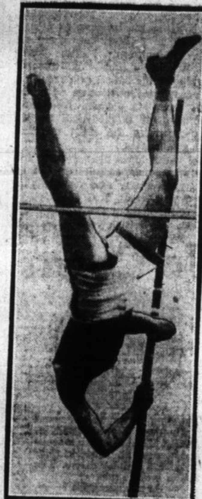
A Yale man about to clear the bar in the pole vault at the inter-varsity sports at Wembley stadium.