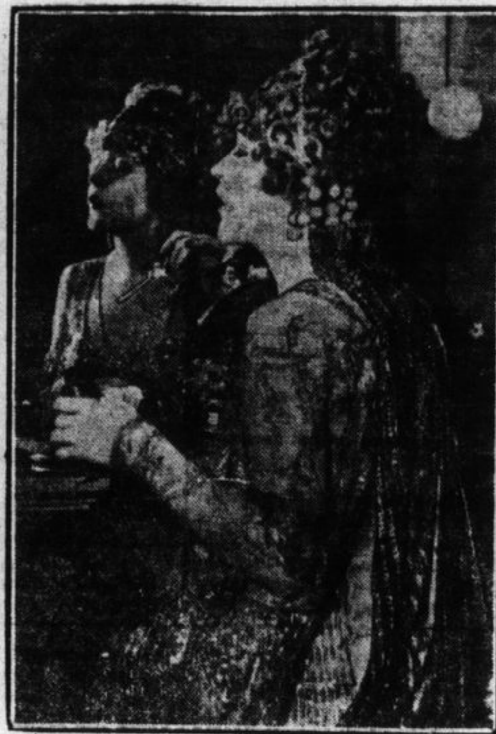
Mae Murray administers some delicately fragrant French perfume prior to taking a scene for her latest picture.